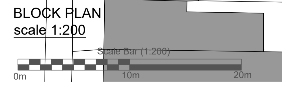
BLOCK PLAN scale 1:200

© Crown Copyright 2006 Reproduction in whole or in part is prohibited without the prior permission of Ordnance Survey.