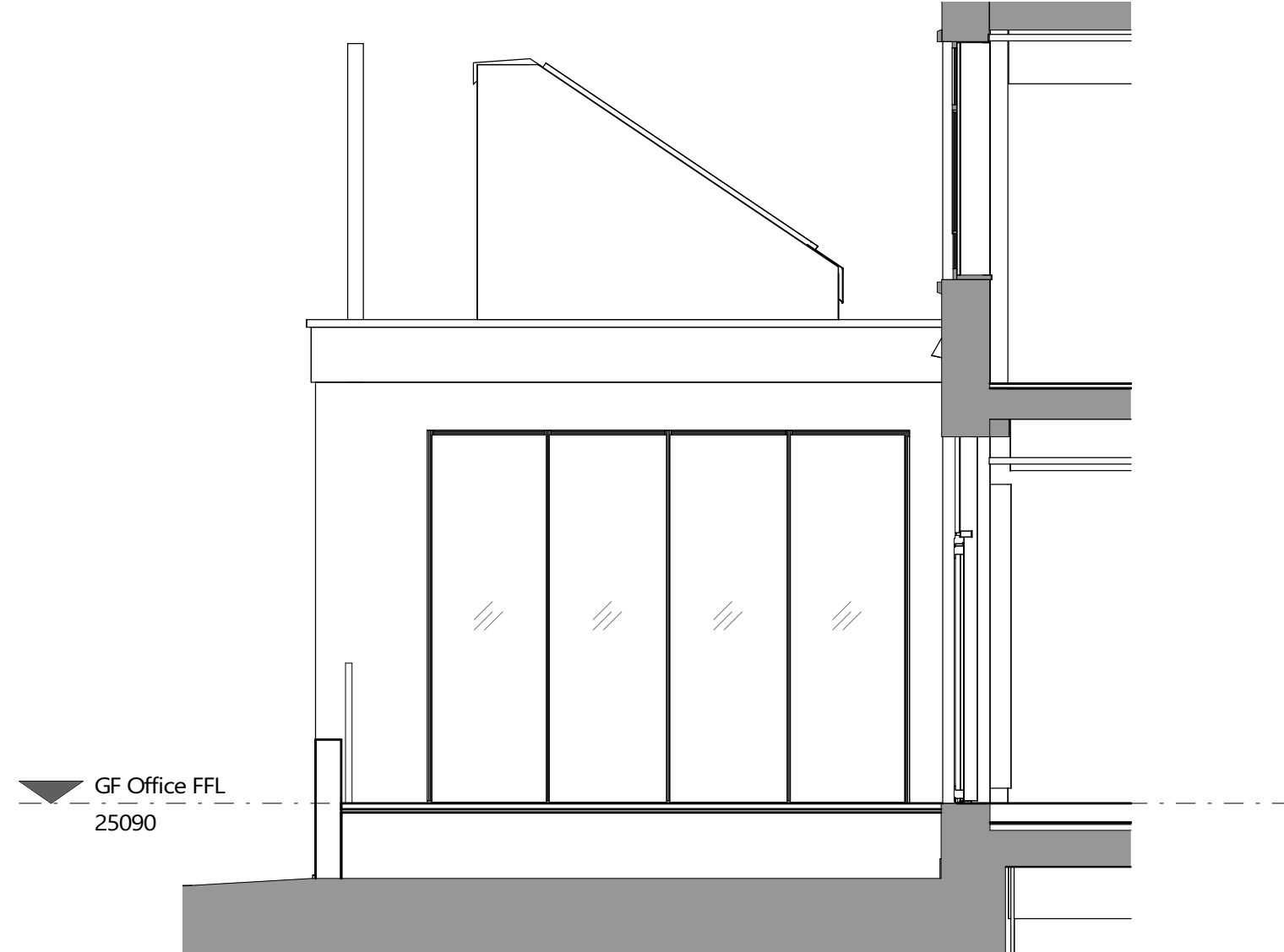
2 Elevation 2 1:50