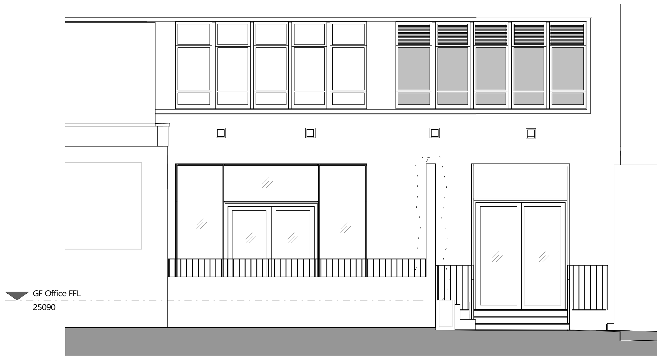
3 Elevation 1B 1:50