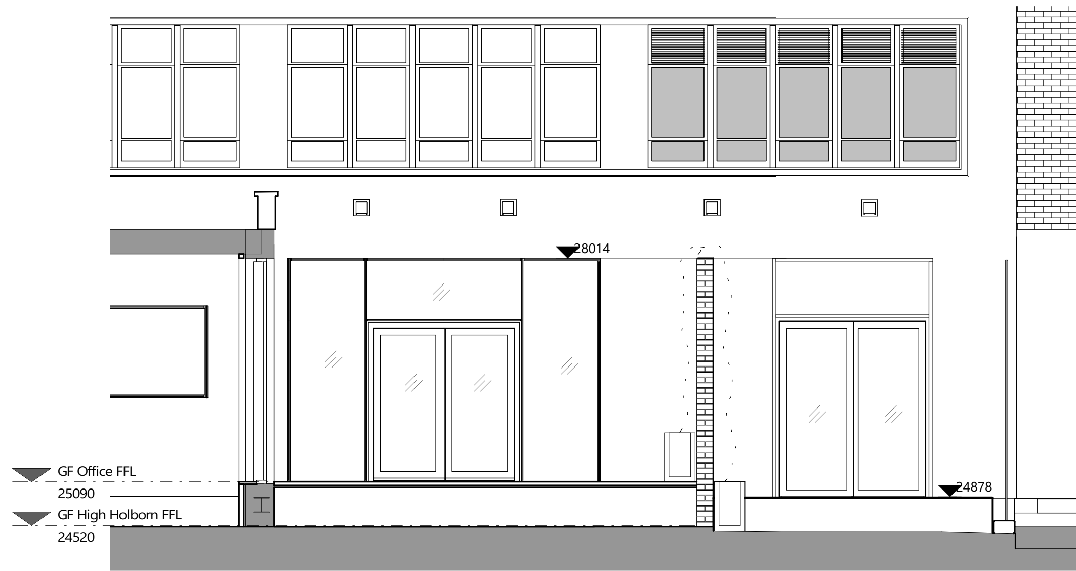
1 Elevation 1A 1:50