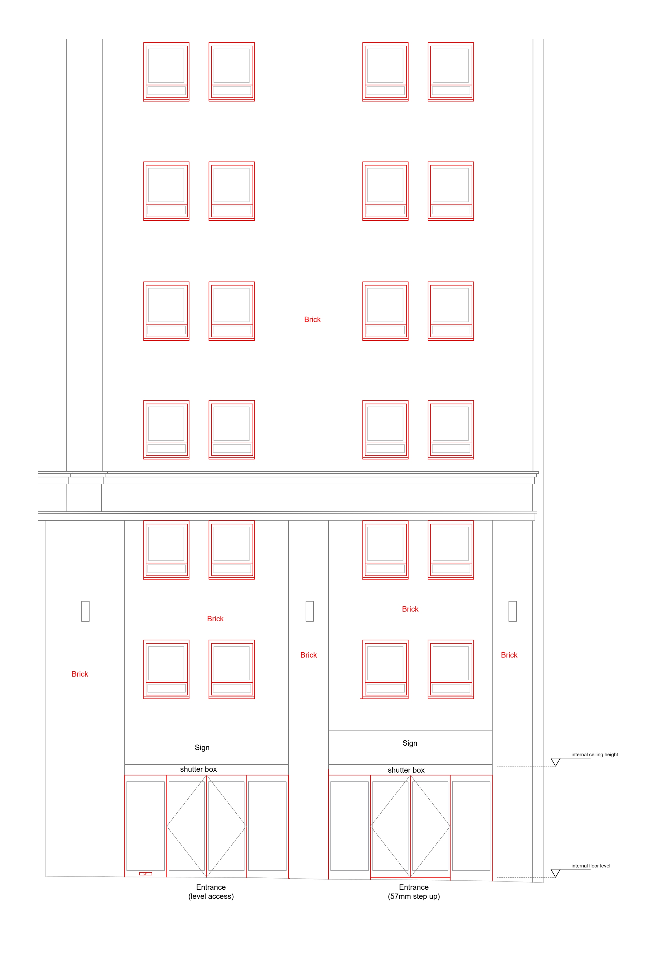
ELEVATION 1 - FRONT