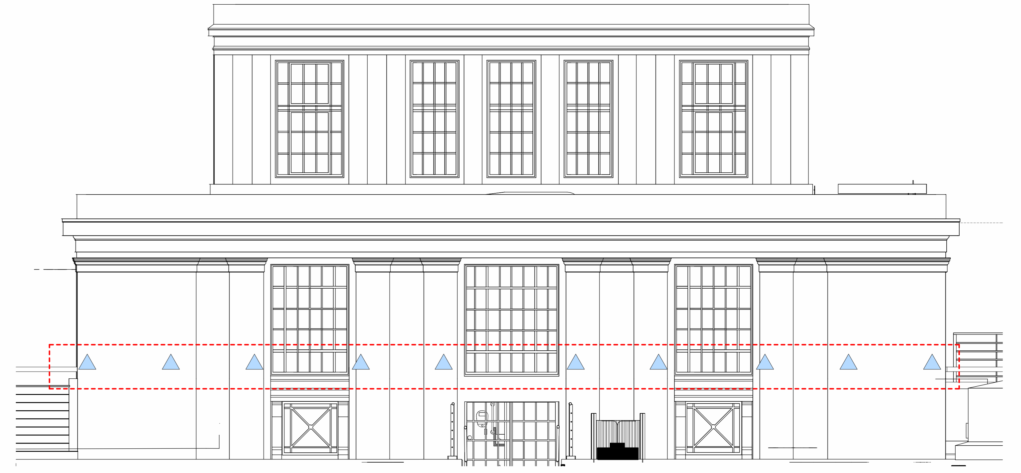
3 Elevation - Southampton Row 1:50