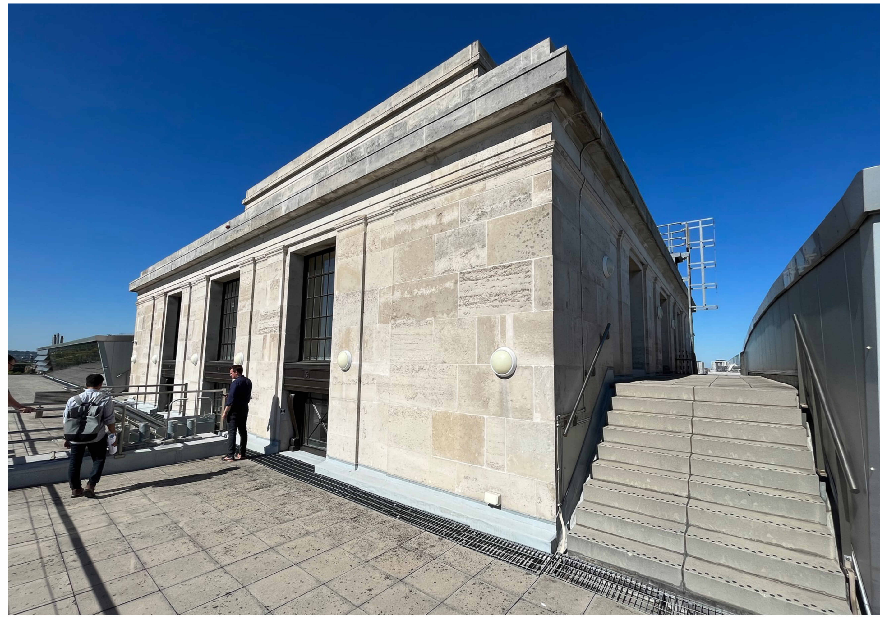
EXISTING PHOTOGRAPH OF BLOOMSBURY SQUARE SIDE OF THE BUILDING. ALL NEW LIGHTS WILL BE AT THE SAME HEIGHT AS EXISTING.