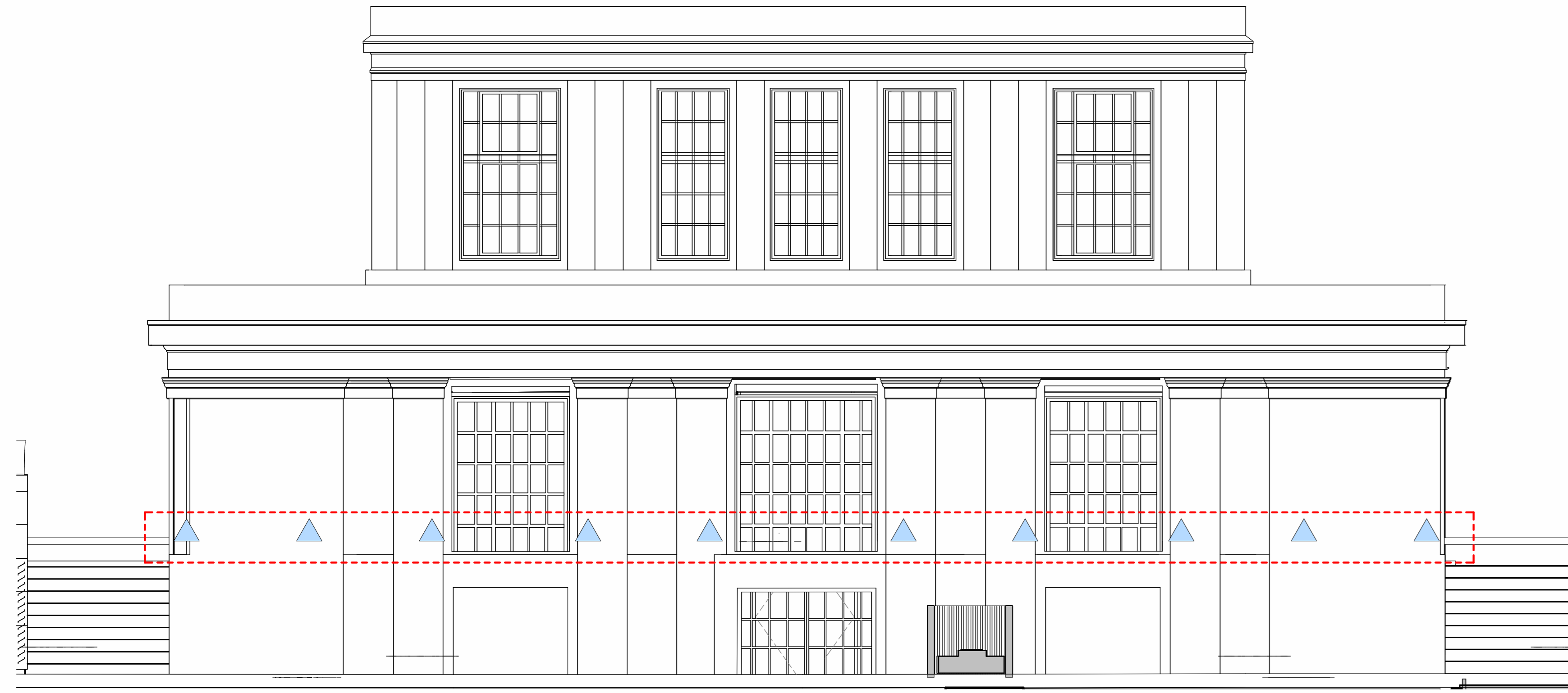
2 Elevation - Bloomsbury Square 1:50