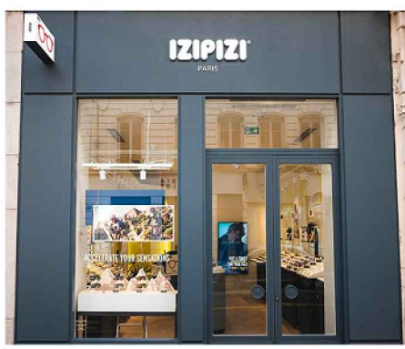
REFERENCE IMAGE No.1: NON-ILLUMINATED SIGNAGE