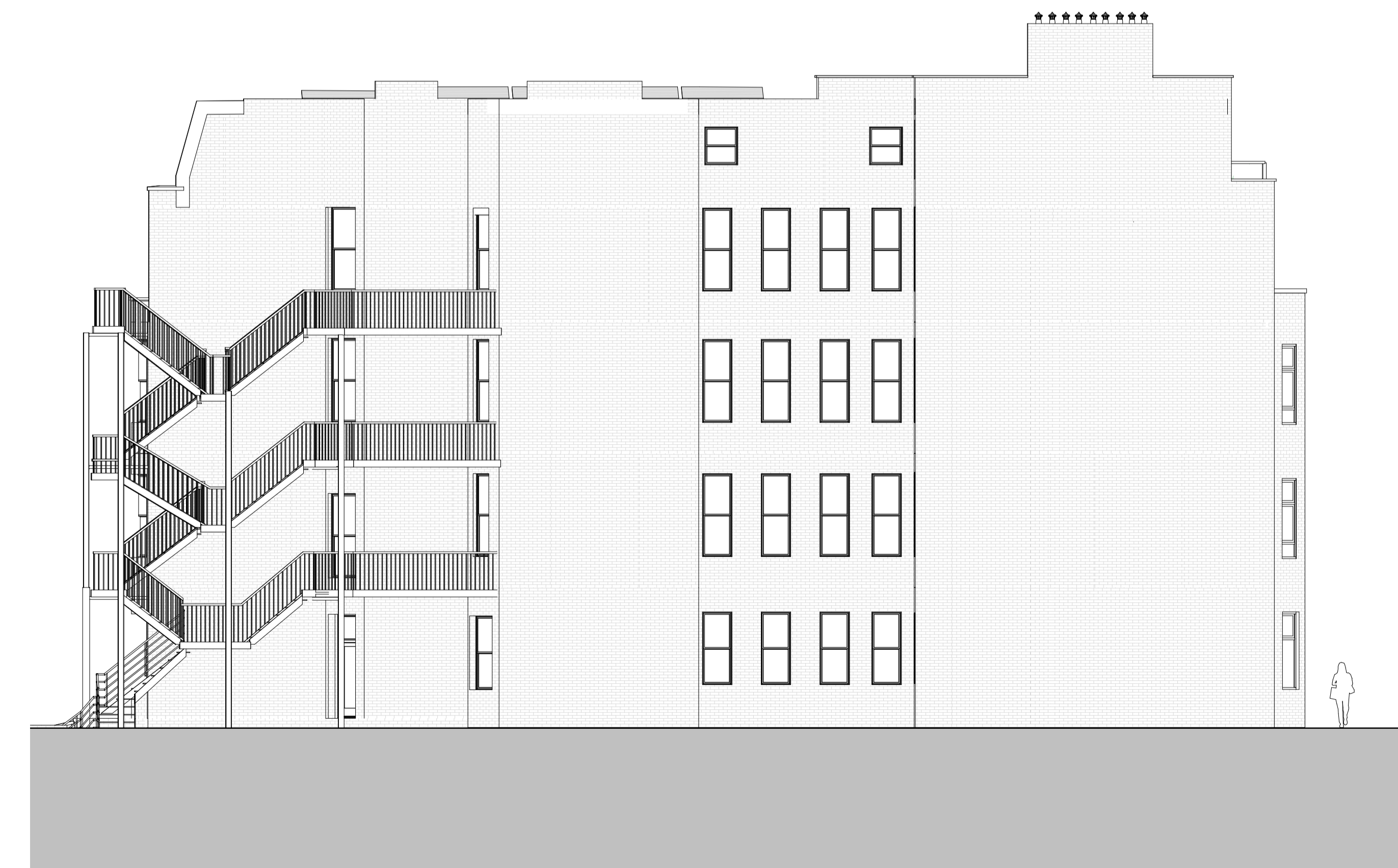
4 Side (South) Elevation - Proposed 1 : 100