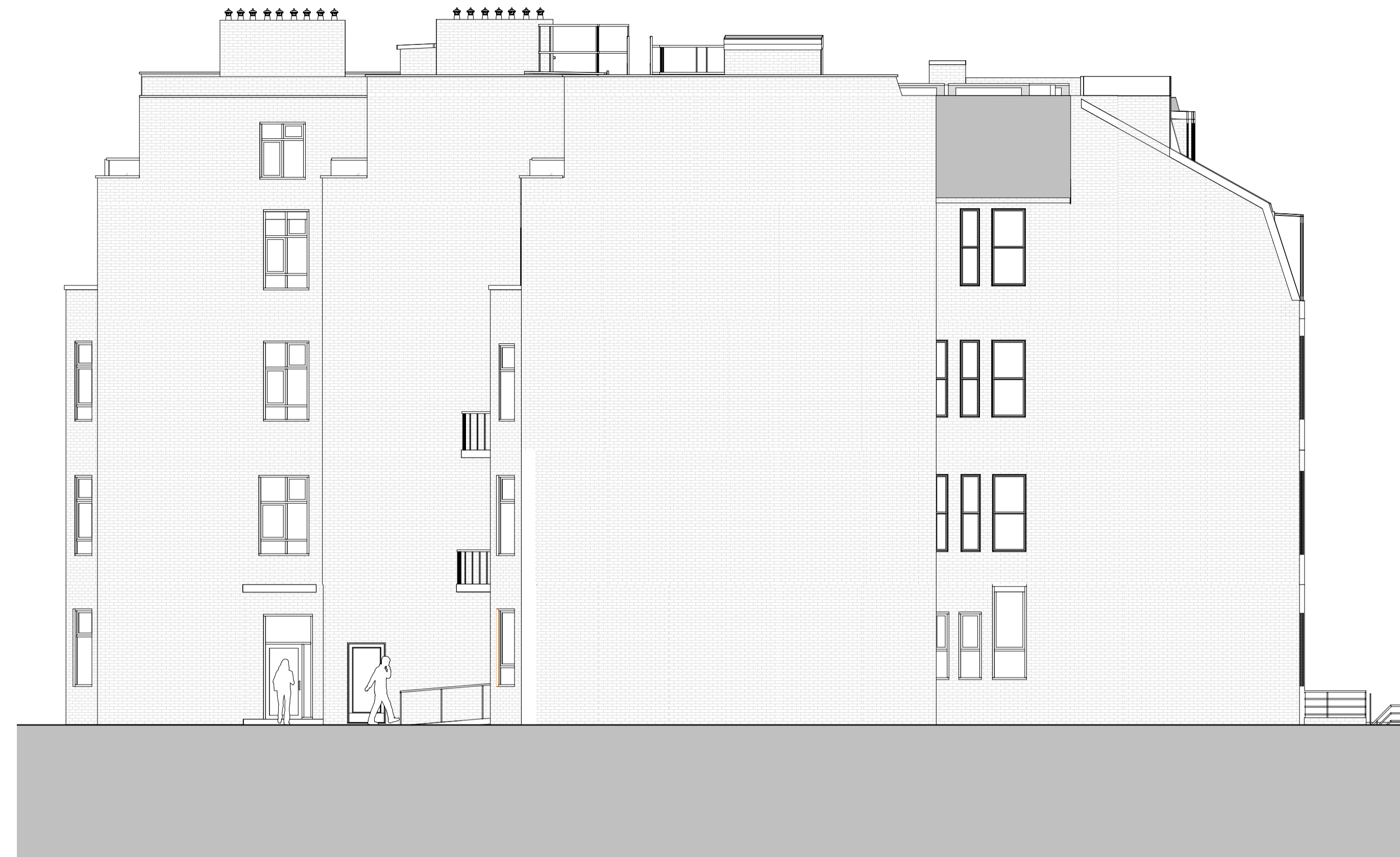
3 Side (North) Elevation - Proposed 1 : 100