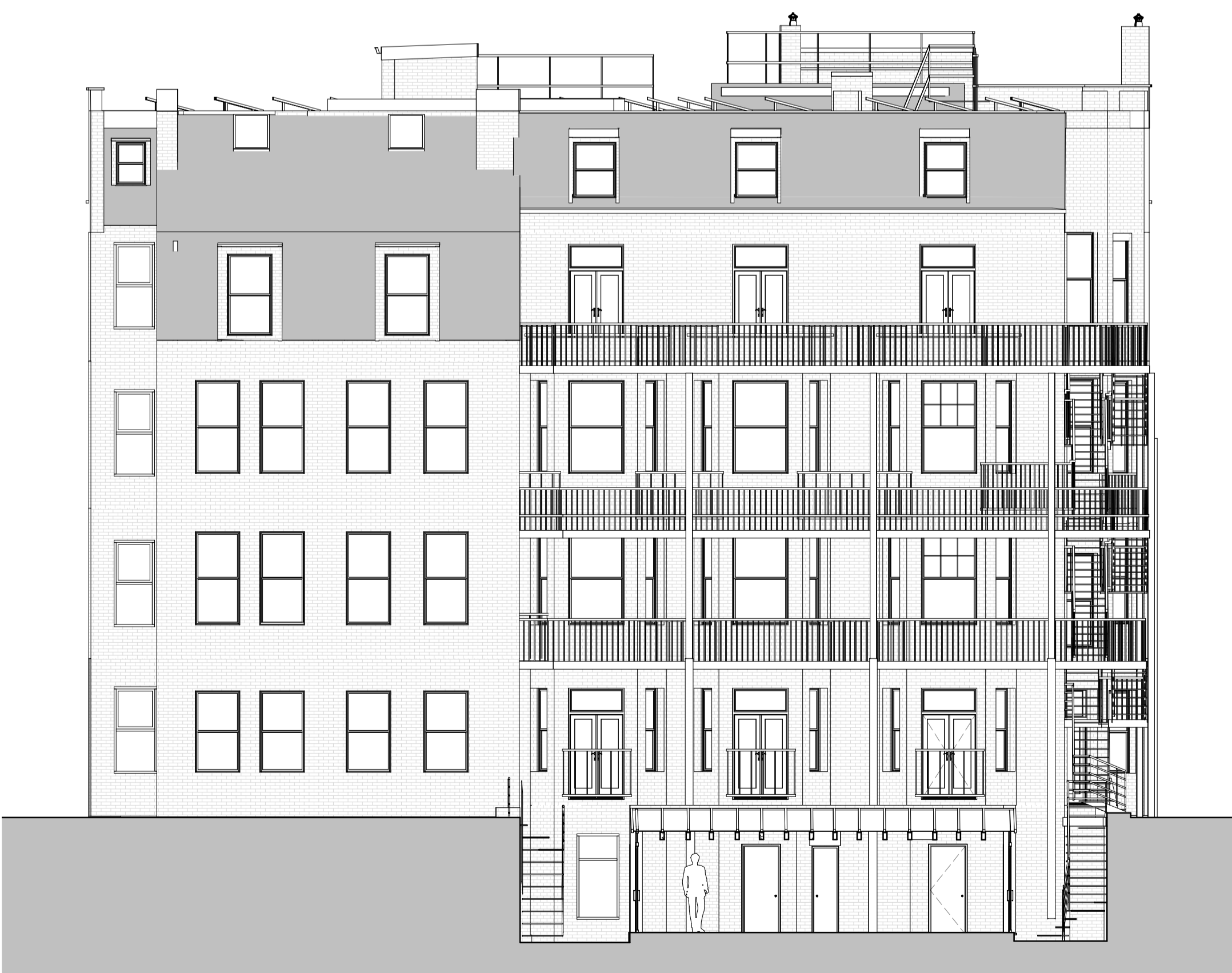
2 Rear (West) Elevation - Proposed 1 : 100