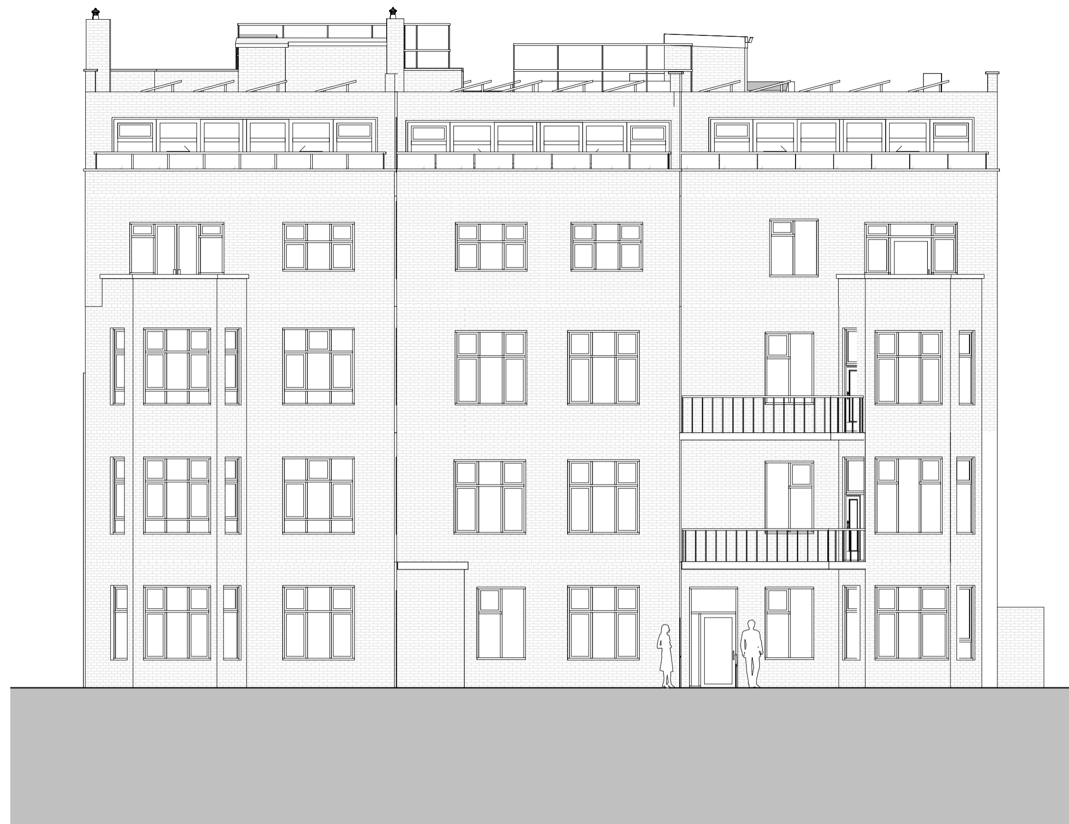
1 Front (East) Elevation - Proposed 1 : 100