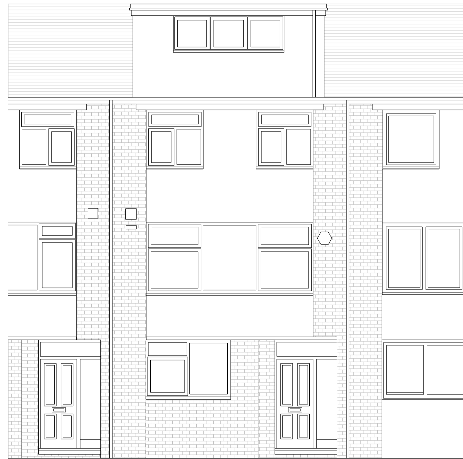
01 Existing Front Elevation Scale 1:50 @A1 / 1:100 @A3