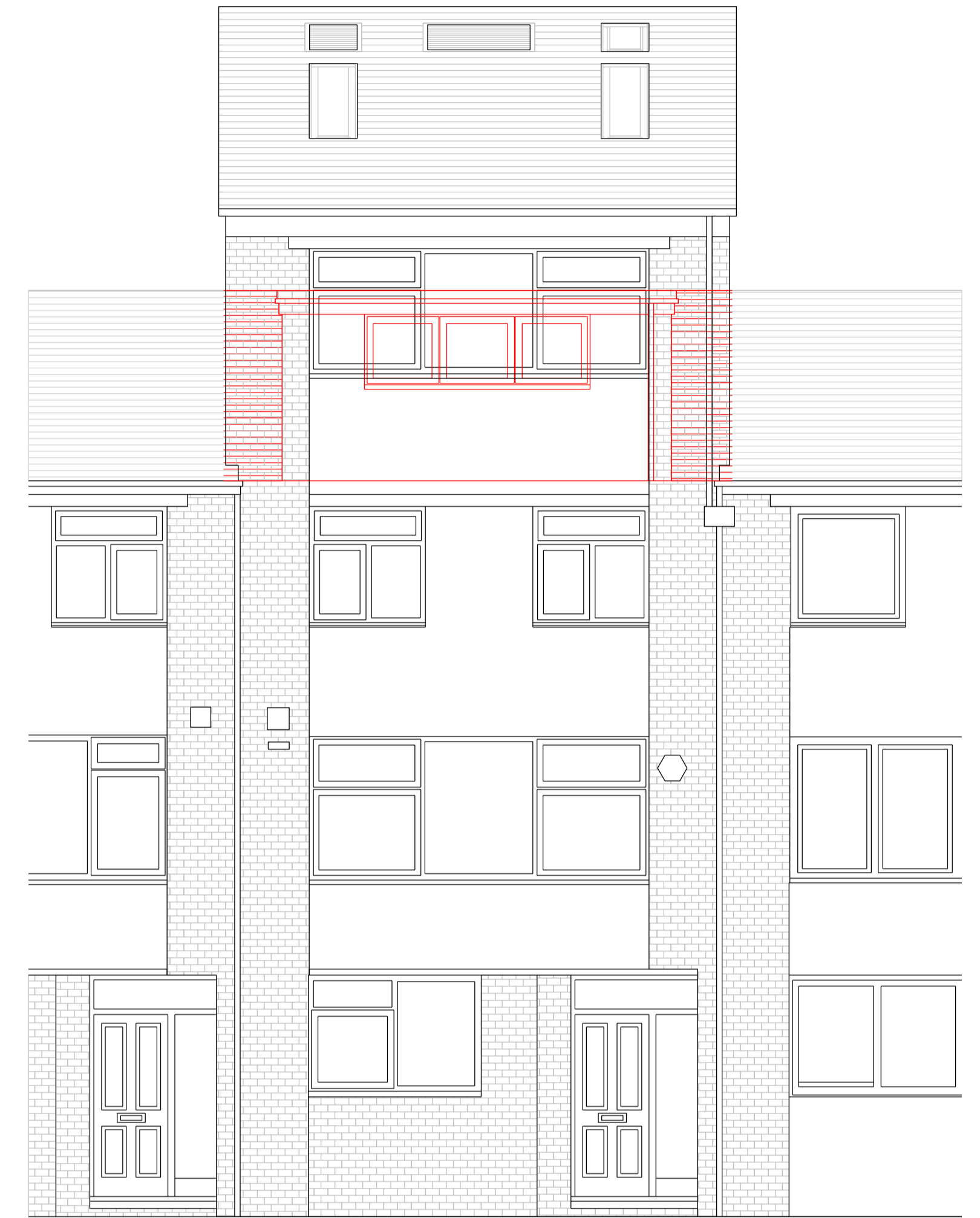
03 Existing and Proposed Front Elevation Overlay Scale 1:50 @A1 / 1:100 @A3