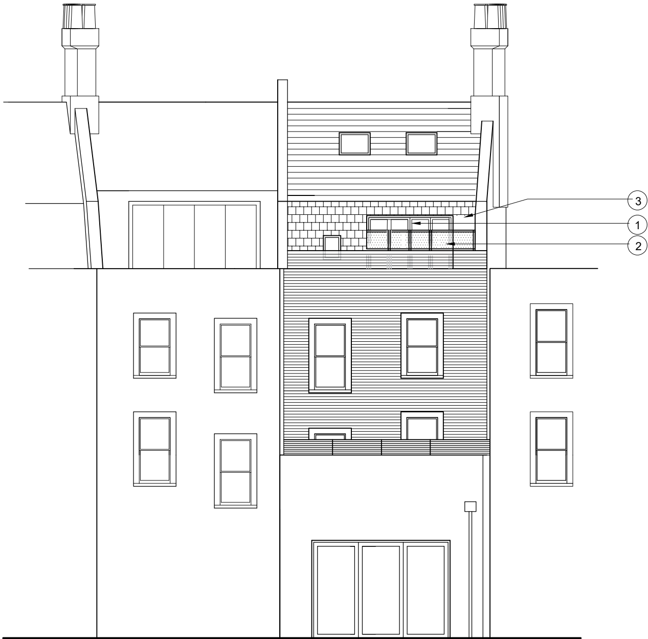
1 REAR ELEVATION