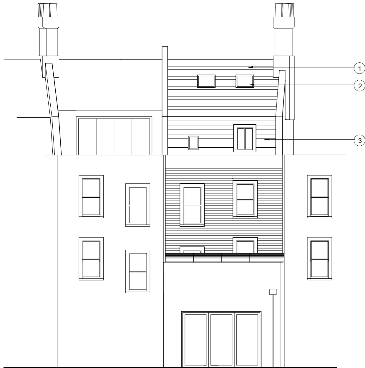
1 REAR ELEVATION