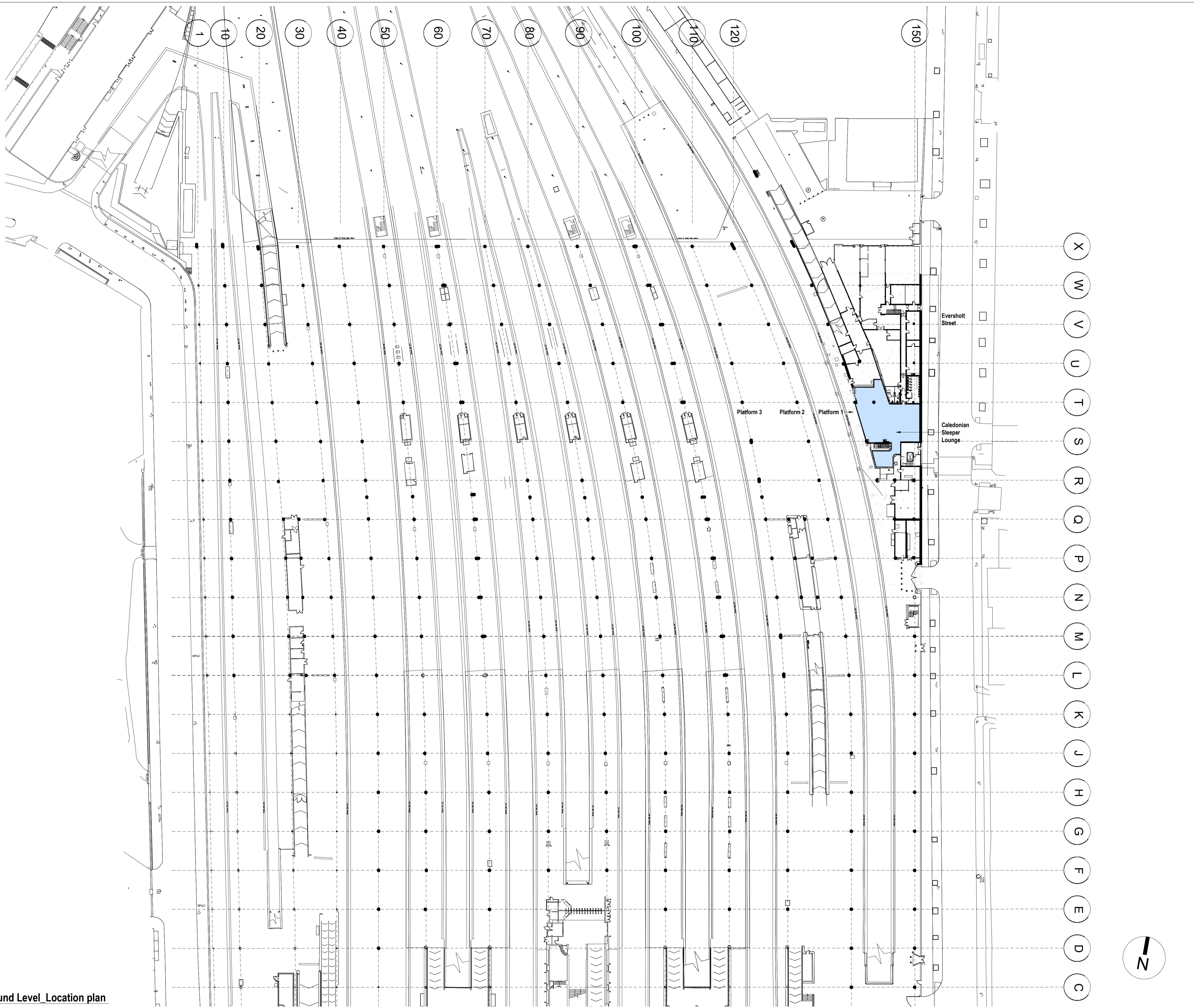
GA Ground Level Location plan 1:500

This drawing may contain Ordnance Survey Mastermap and Raster data. Contains OS Data © Crown Copyright and database right 2017. Ordnance Survey Licence number 100055742.