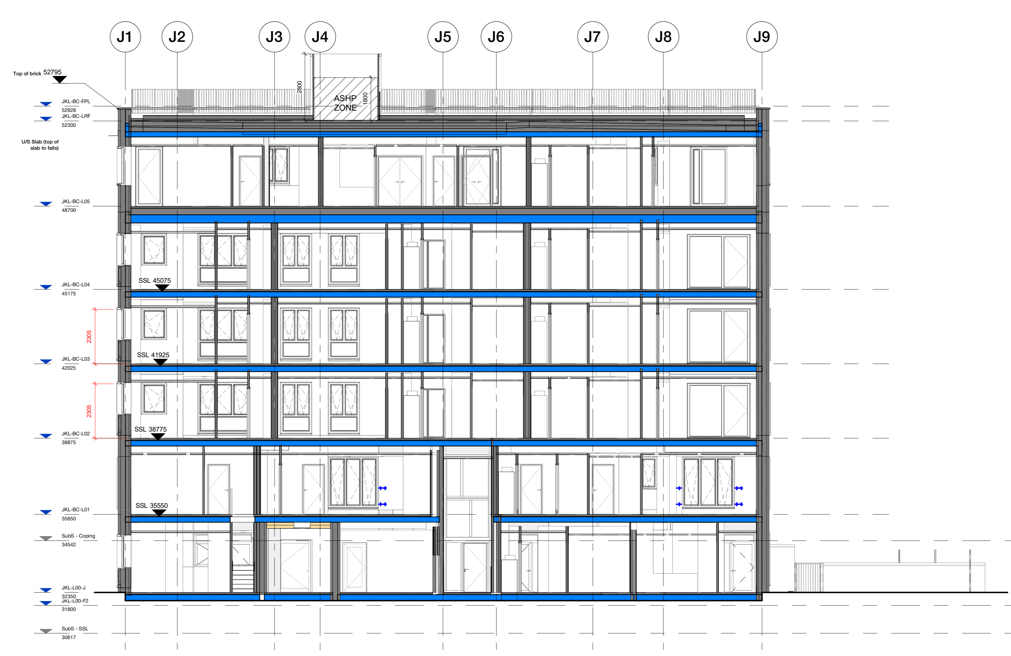
3 GA Sections - Long Section C-C 1 : 100

Key Current Structural Engineer's information - from latest Datax Model (17.12.21)