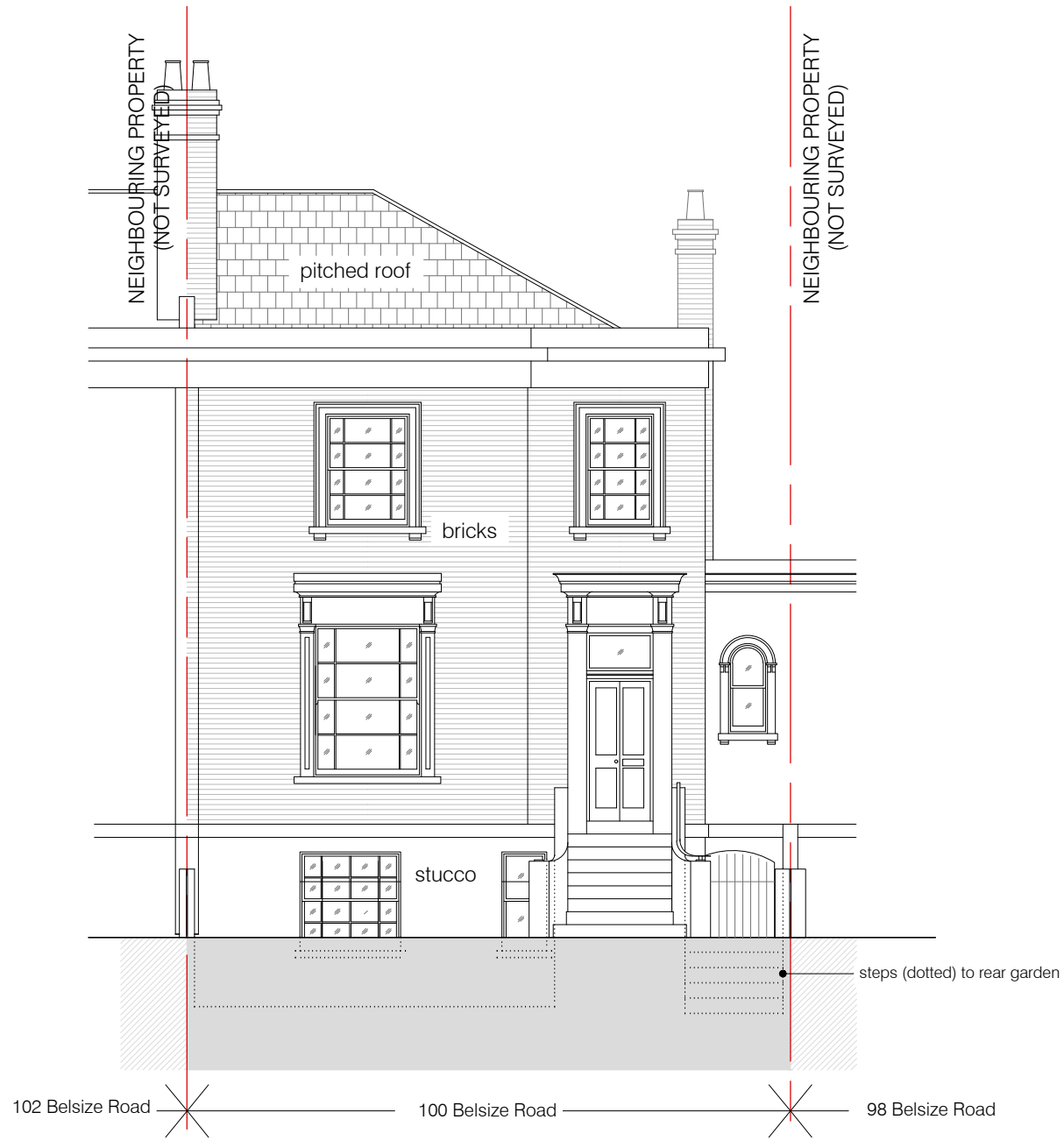
01 EXISTING FRONT ELEVATION scale 1:100