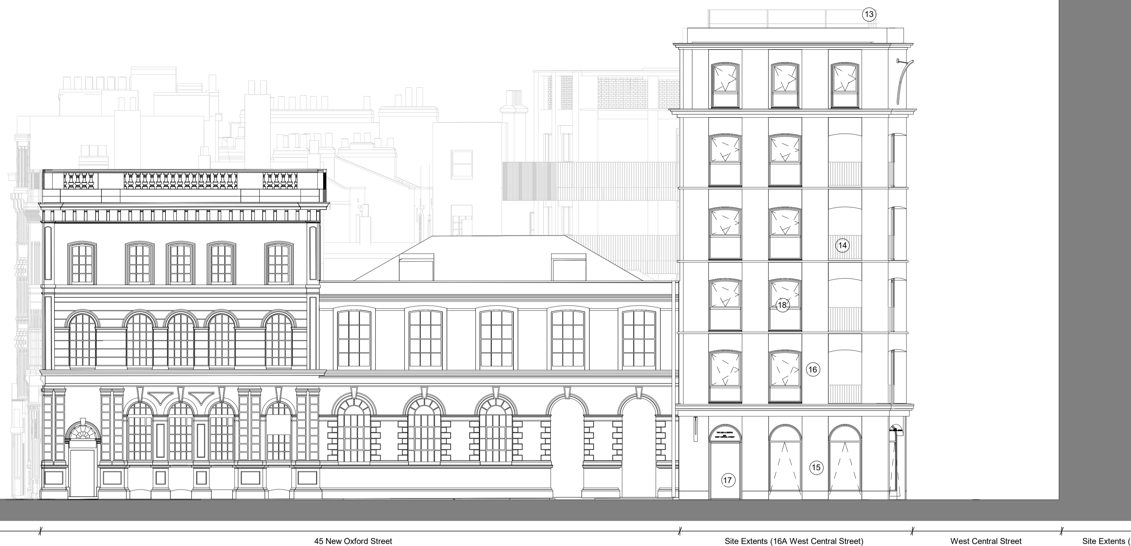
1 West Central Street - Proposed South West Elevation

REPORT DISCREPANCIES DO NOT SCALE FROM THIS DRAWING COPYRIGHT DSDHA USE LATEST REVISION CHECK DIMENSIONS ON SITE