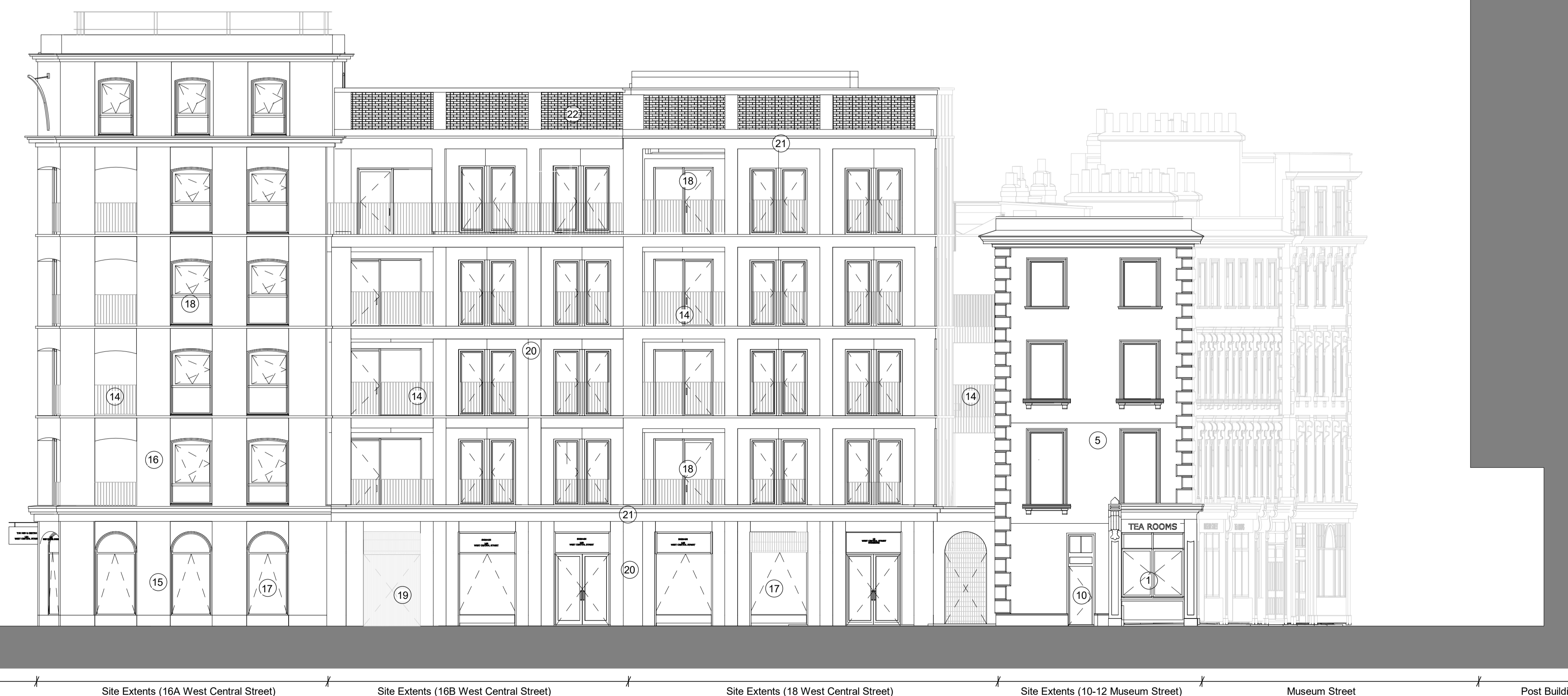
2 West Central Street - Proposed South East Elevation