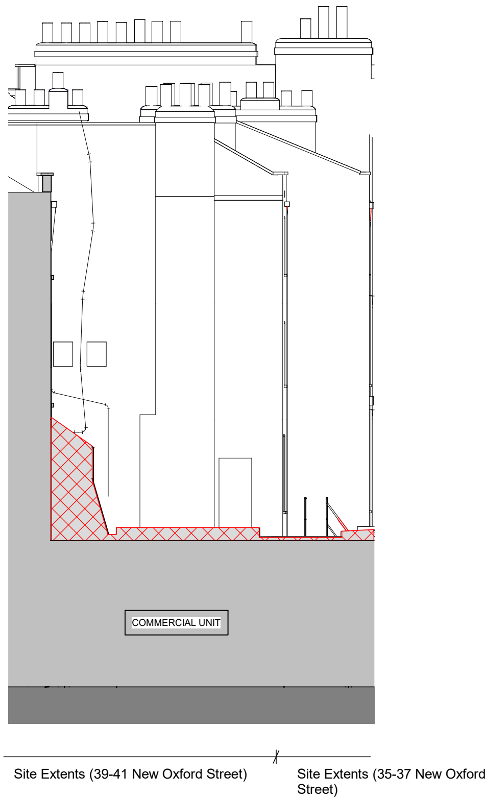
2 Courtyard - West A - Proposed Demolition Elevation