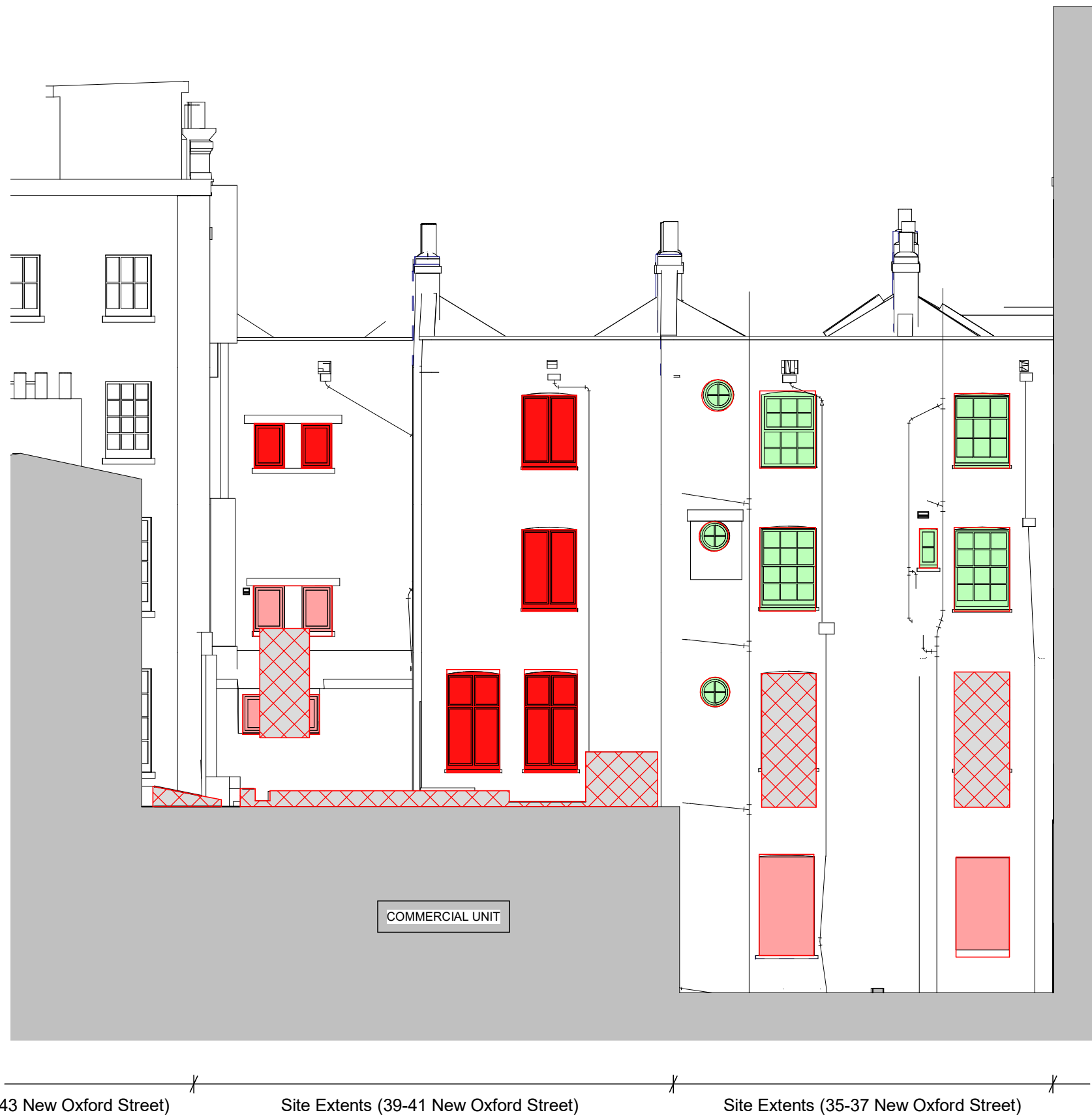
1 Courtyard South - Proposed Demolition Elevation