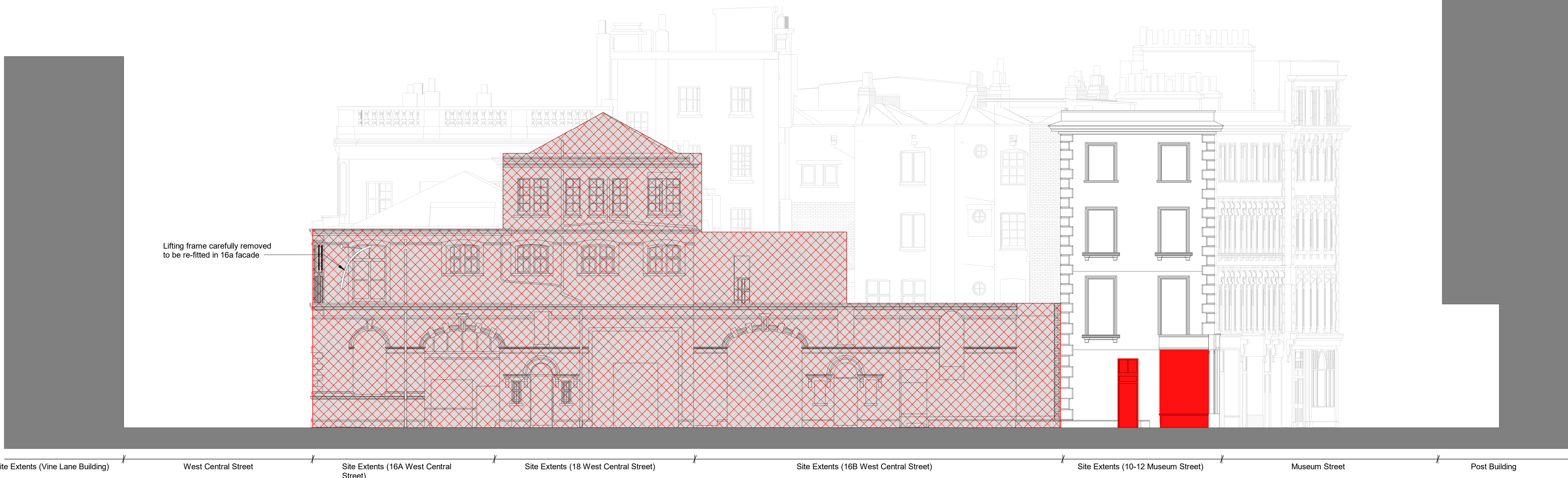
West Central Street - South East - Proposed Demolition Elevation

drawn size date scale Author A1 22/03/21 1 : 100 drawing number revision 295B_P10.401 B REPORT DISCREPANCIES DO NOT SCALE FROM THIS DRAWING COPYRIGHT DSDHA USE LATEST REVISION CHECK DIMENSIONS ON SITE