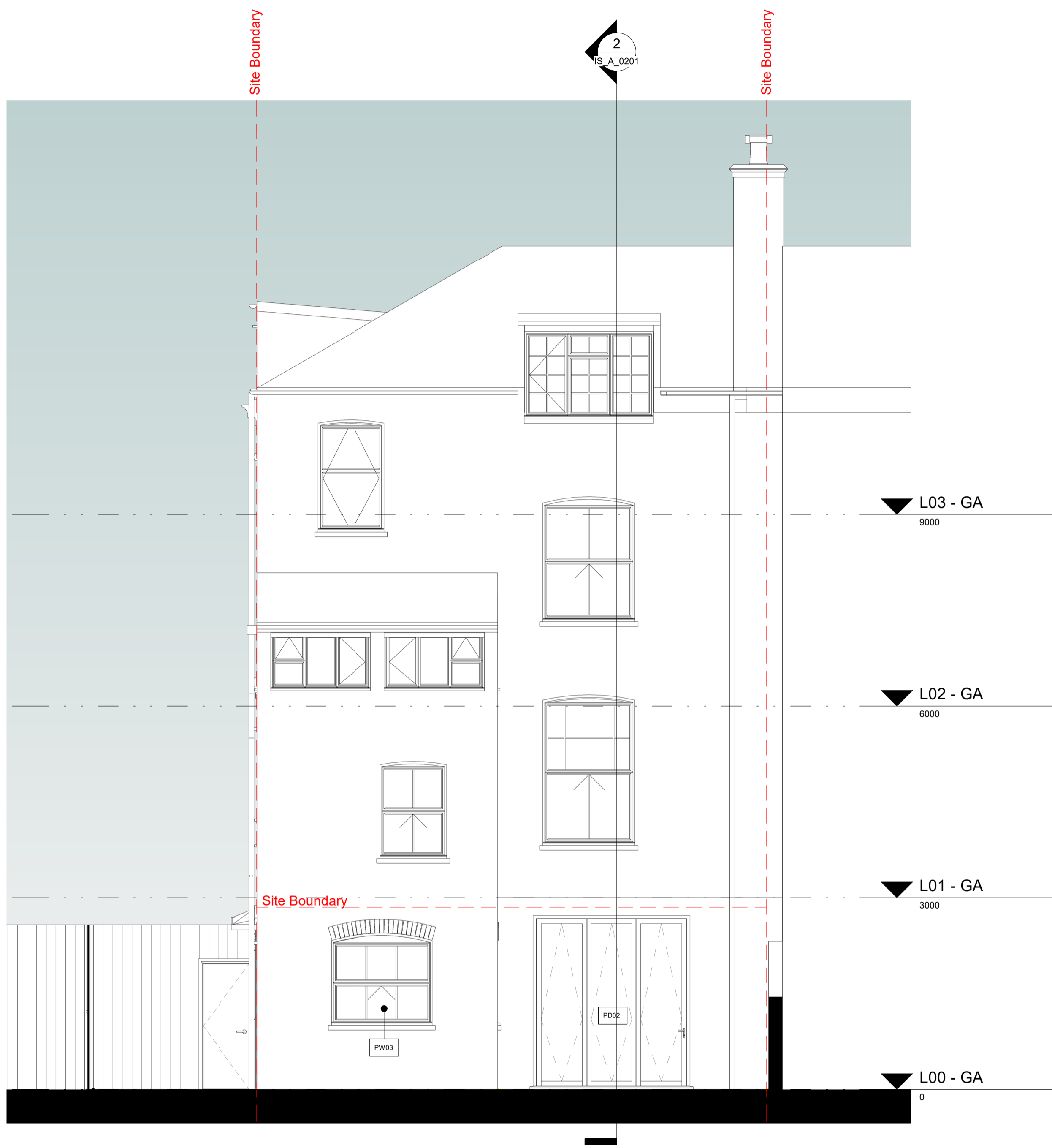
1. PROPOSED GA SOUTH ELEVATION 1 : 50