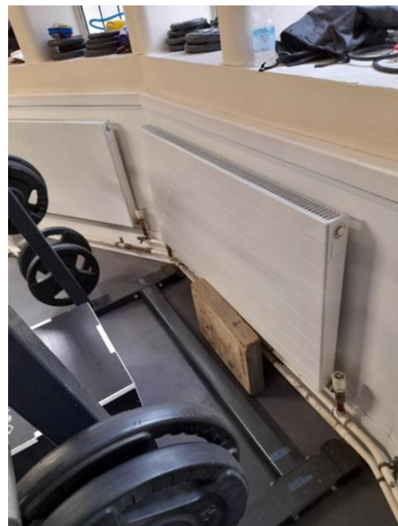
Photograph 06 – Existing Radiators