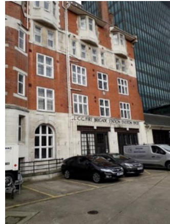
Photograph 02 – Euston Fire Station