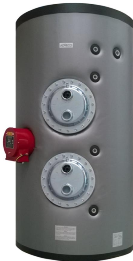
Domestic Hot Water Heater – ADVECO SSI 500/1.5