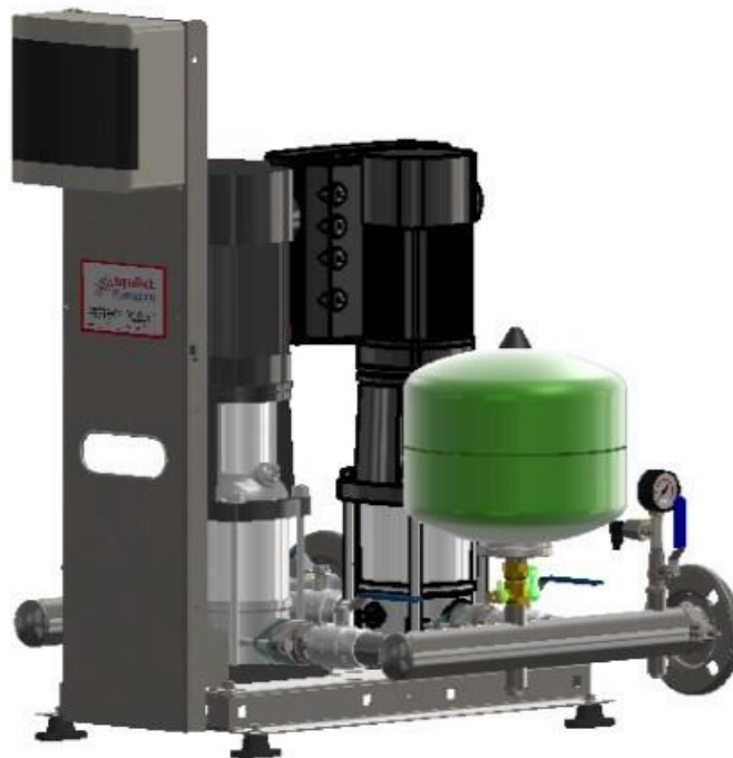
Booster Set – AQUATECH PRESSMAIN AMV2-FE-6-4