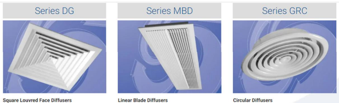
Diffusers – Gilberts BLACKPOOL Series