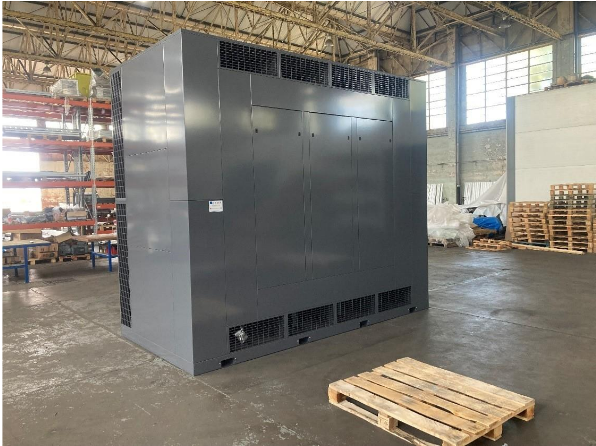
PROPOSED NEW ACOUSTIC ENCLOUSER