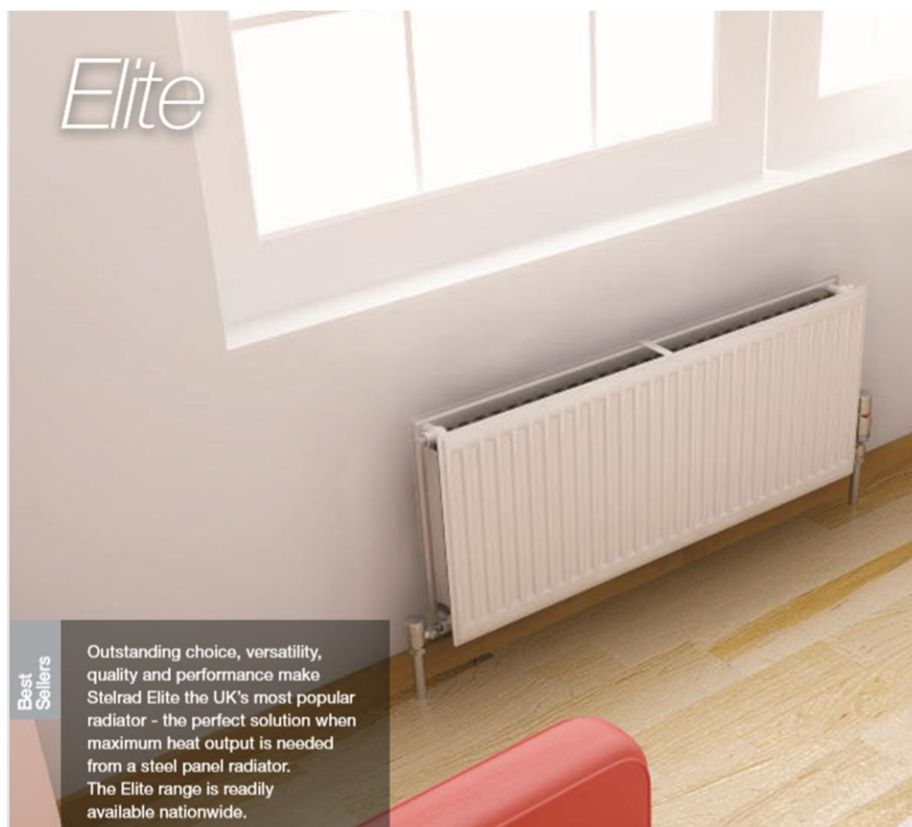
Radiators – Stelrad ELITE K1