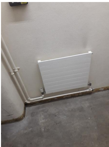
Photograph 05 – Existing Radiators