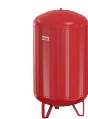
Expansion Vessel – FLAMCO FLEXCON