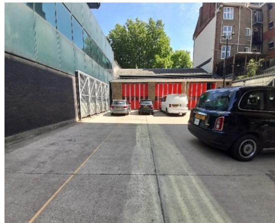
Photograph 04 – Proposed Location for ASHP