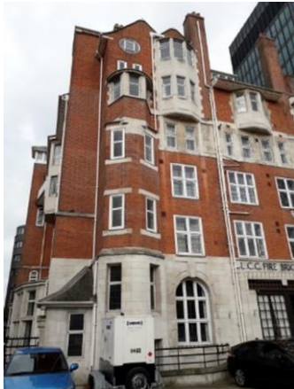
Photograph 01 – Euston Fire Station