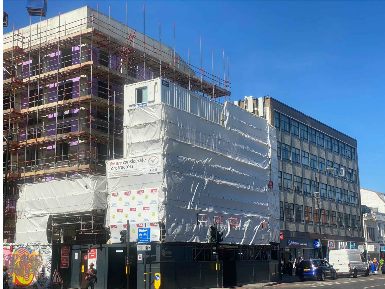
VIEW OF EXISTING SITE