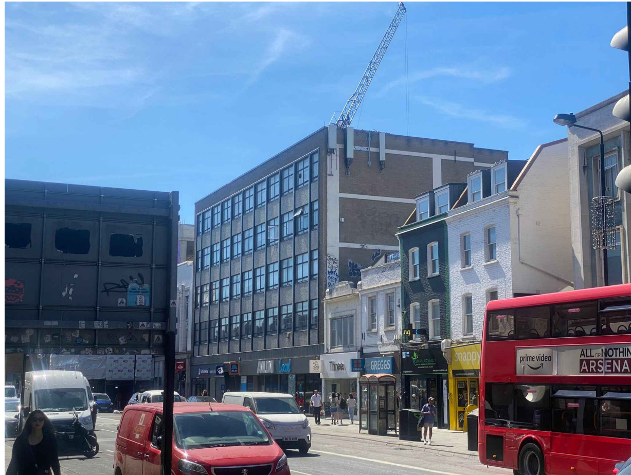
VIEW OF EXISTING SITE