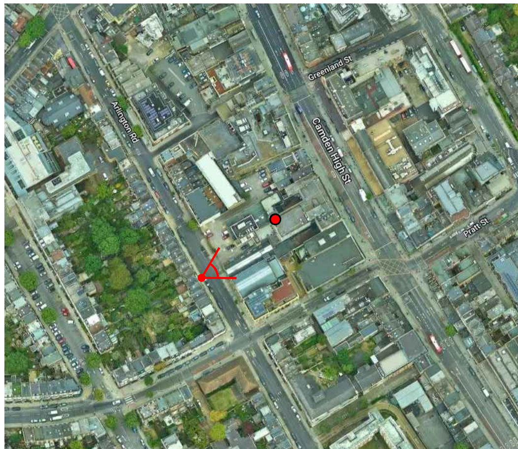
CAMERA LOCATION MAP