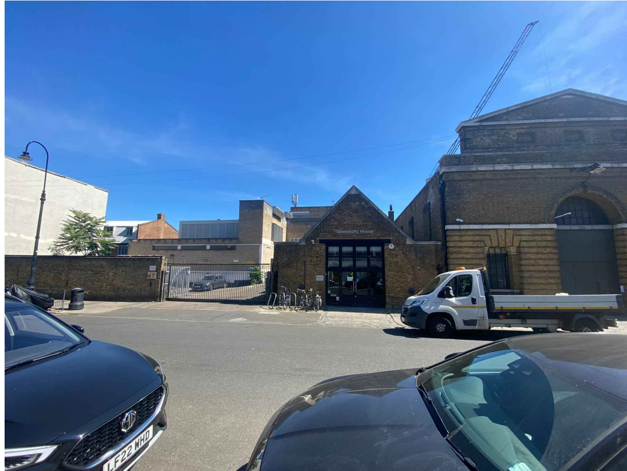
VIEW OF EXISTING SITE