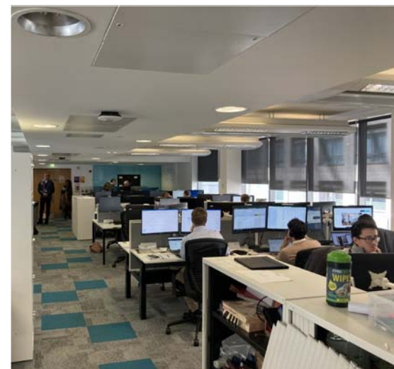
2 PHOTOS AS EXISTING

© Architon LLP 2014 This drawing is the property of Architon LLP and must not be divulged to anyone, copied or reproduced, or used for marketing, advertising or promotional purposes without the express written permission of Architon LLP. All dimensions are to be checked on site and not scaled from this drawing. Contractors must verify all dimensions on site before setting out, commencing work or preparing shop drawings. Any discrepancies on this drawing with other contract documentation to be reported immediately for clarification.