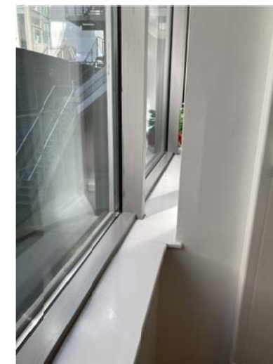
2 PHOTOS AS EXISTING