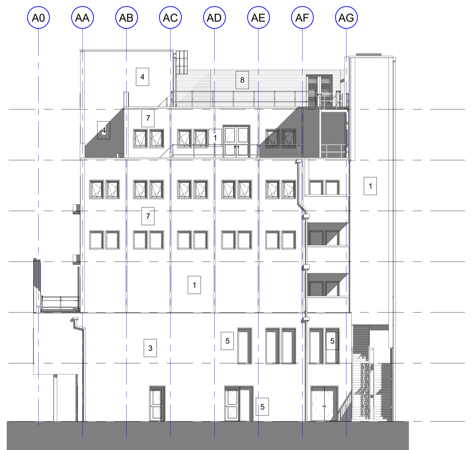
1. EAST 1 : 150

WINDOWS ALL WINDOWS EXCEPT AS NOTED BELOW AND GROUND FLOOR WITHIN BLACK CLADDING TO BE RAL 7039