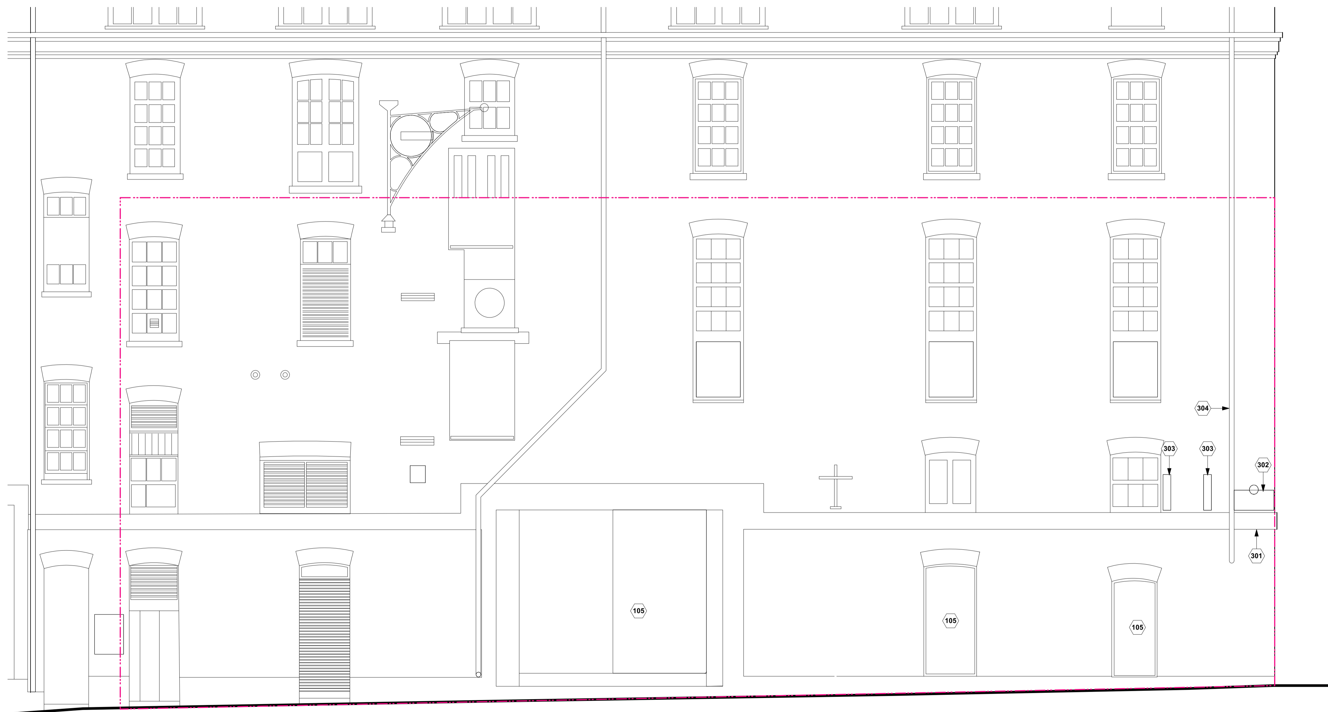
1 EXISTING SHELTON STREET ELEVATION