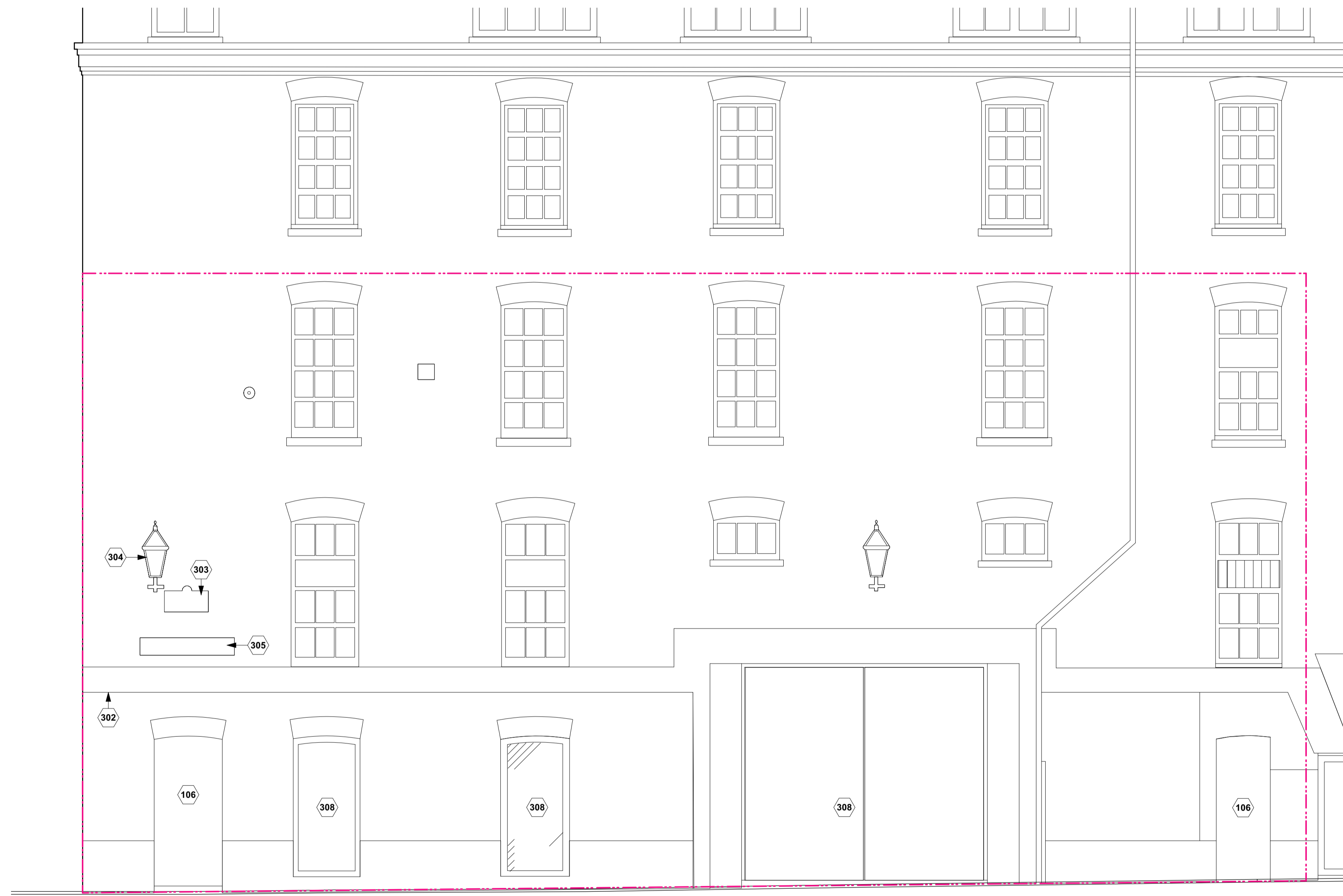
2 EXISTING EARLHAM STREET ELEVATION EX300 SCALE: 1:50 @A1