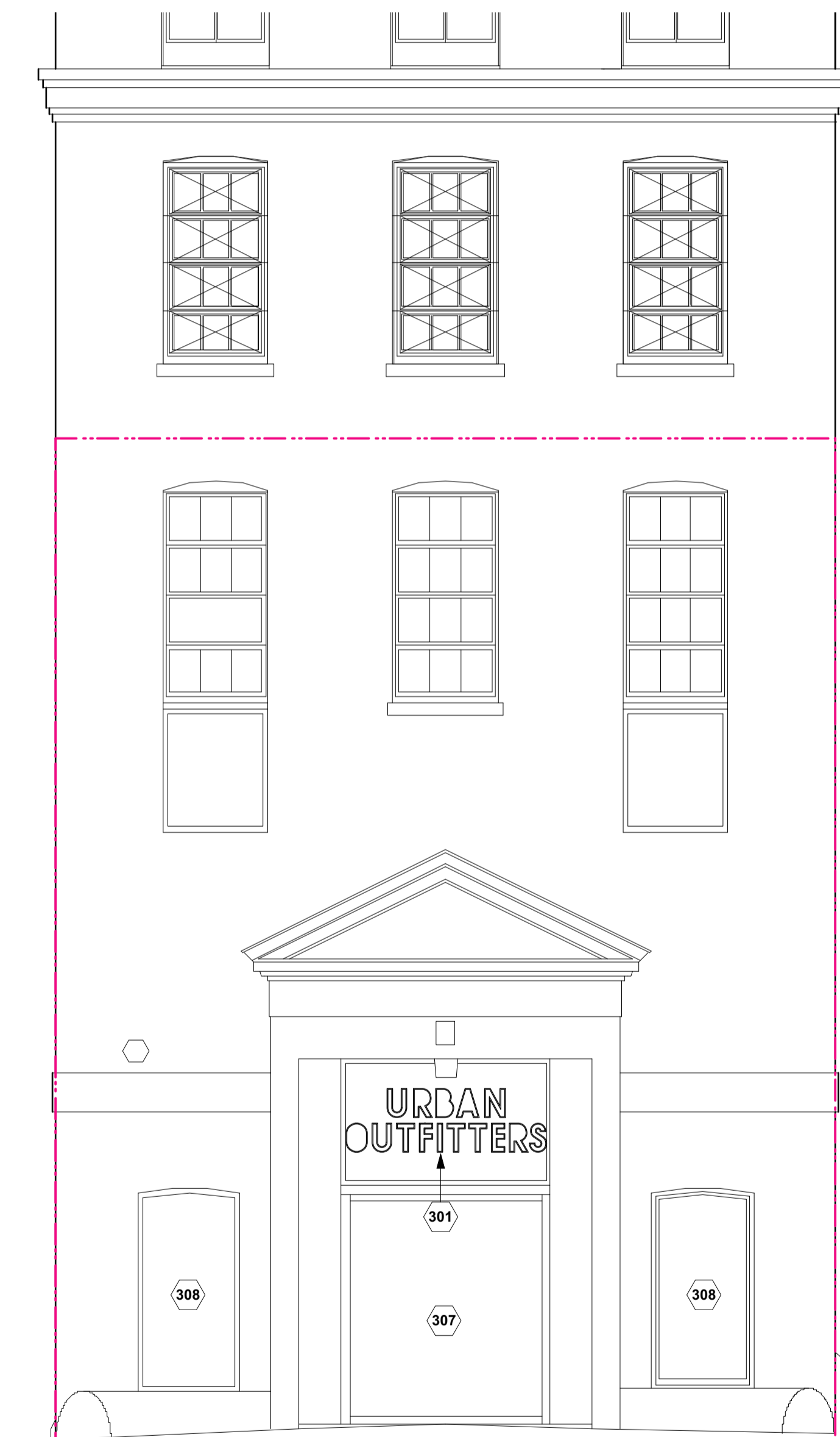
1 EXISTING FRONT ELEVATION EX300 SCALE: 1:50 @A1