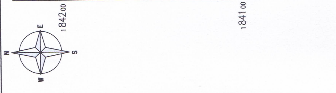
SITE LOCATION (Scale 1:50000) Ordnance Survey map extract based upon Landranger map series with the permission of the controller of Her Majesty's Stationery Office. Licence No. 0100023487 Crown copyright.