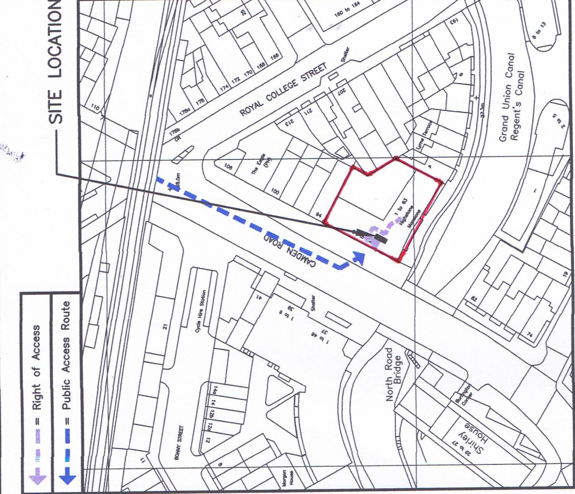
DETAILED SITE LOCATION (Scale 1:1250) Based upon Ordnance Survey map extract with the permission of the Controller of Her Majesty's Stationery Office. Crown copyright. Licence No. 100022432