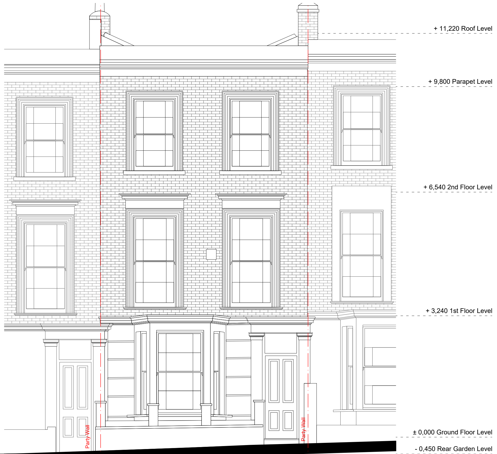
005 01 Existing Front Elevation Scale 1:50 @ A3 / 1:25 @ A1