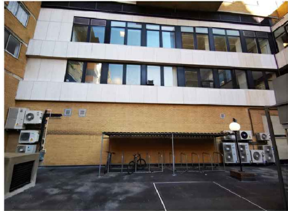
EXISTING OUTDOOR A/C UNITS