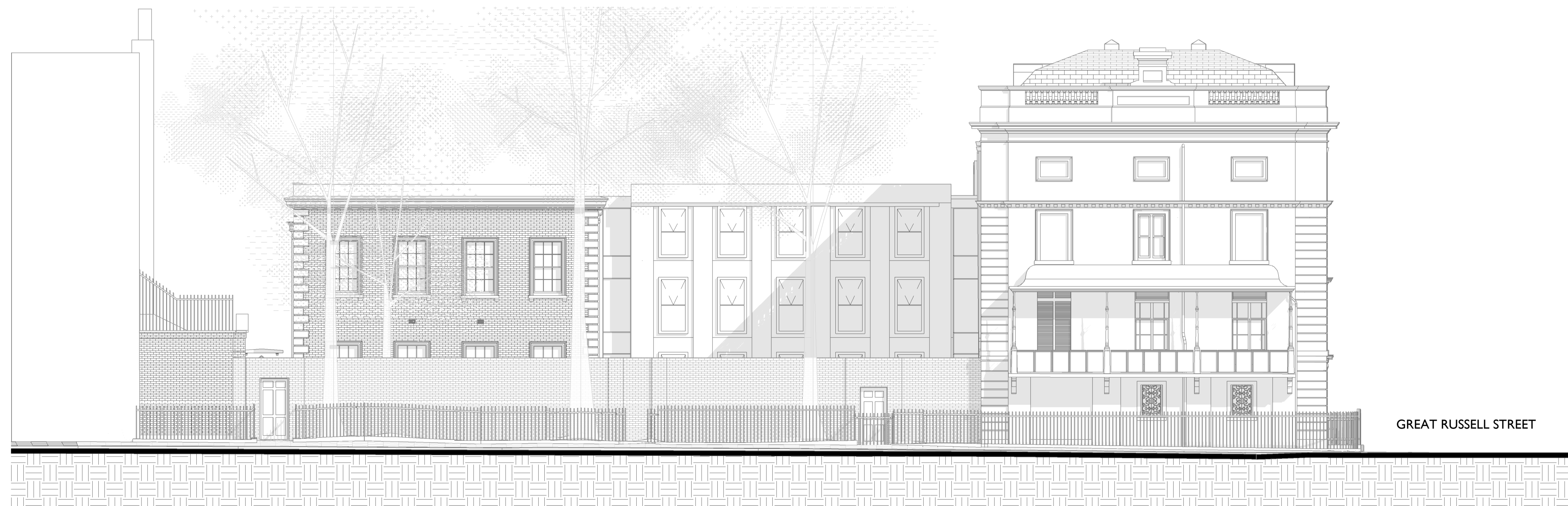
Proposed Street Elevation 1:100

Notes legends or Key plans to be added above here