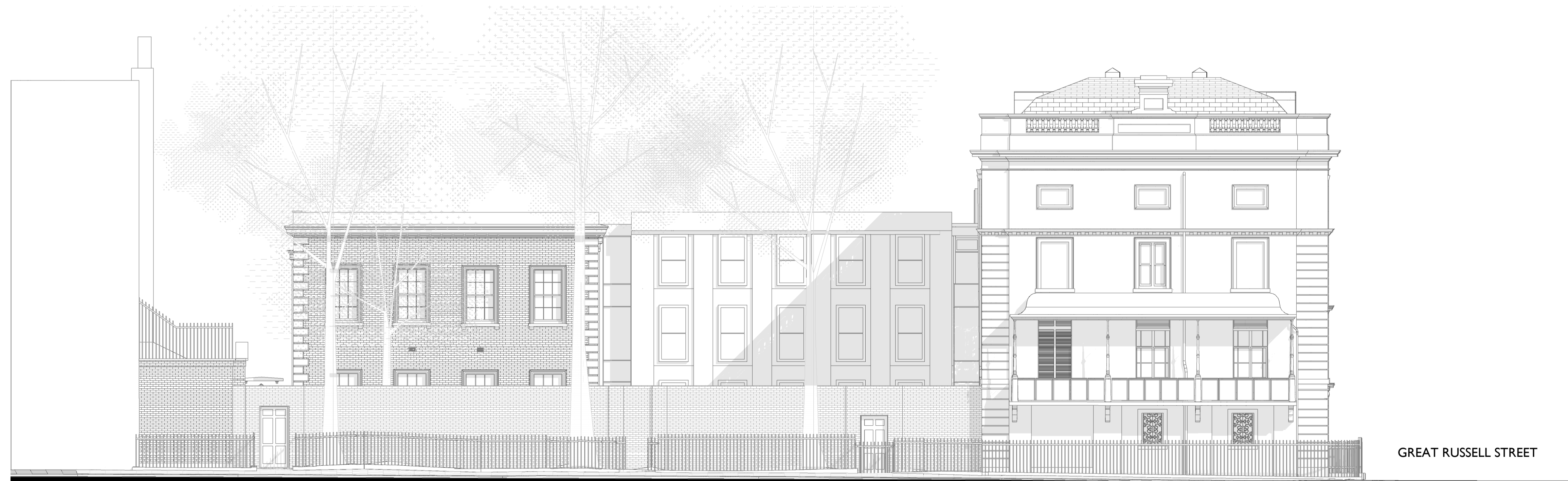
Existing Street Elevation 1 : 100