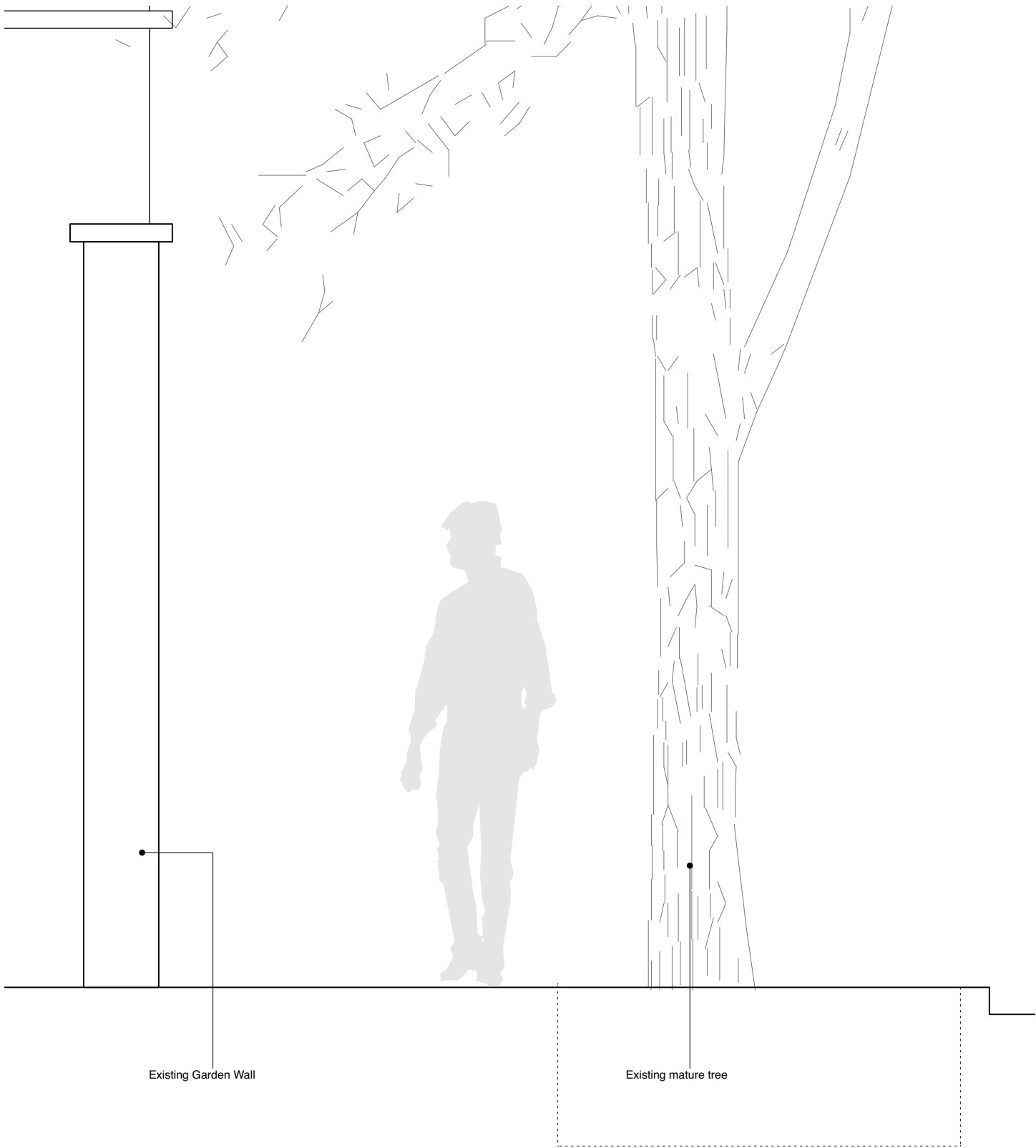
EXISTING SECTION A-A