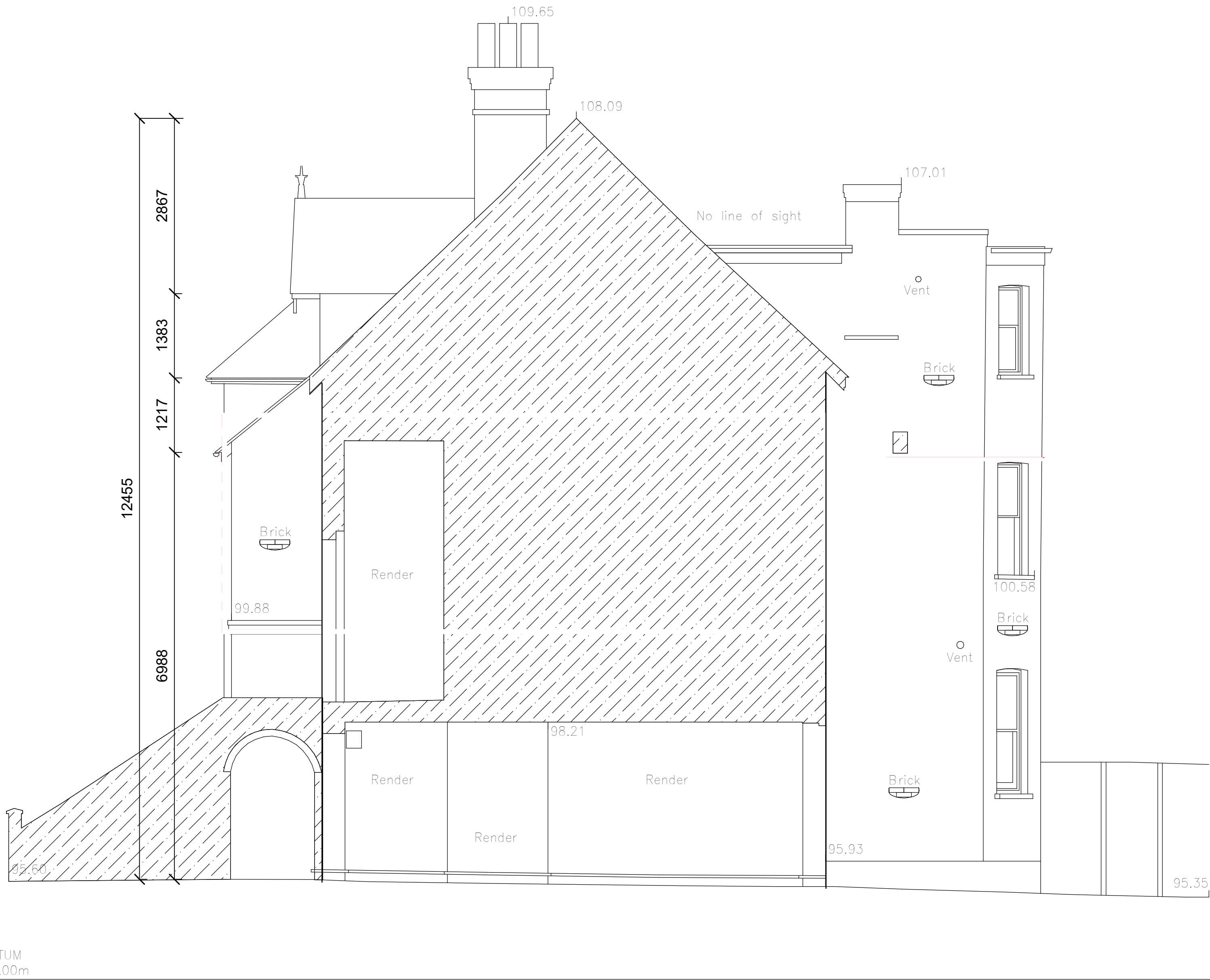
ELEVATION 4 - SOUTH (SEMI-DETTACHED)