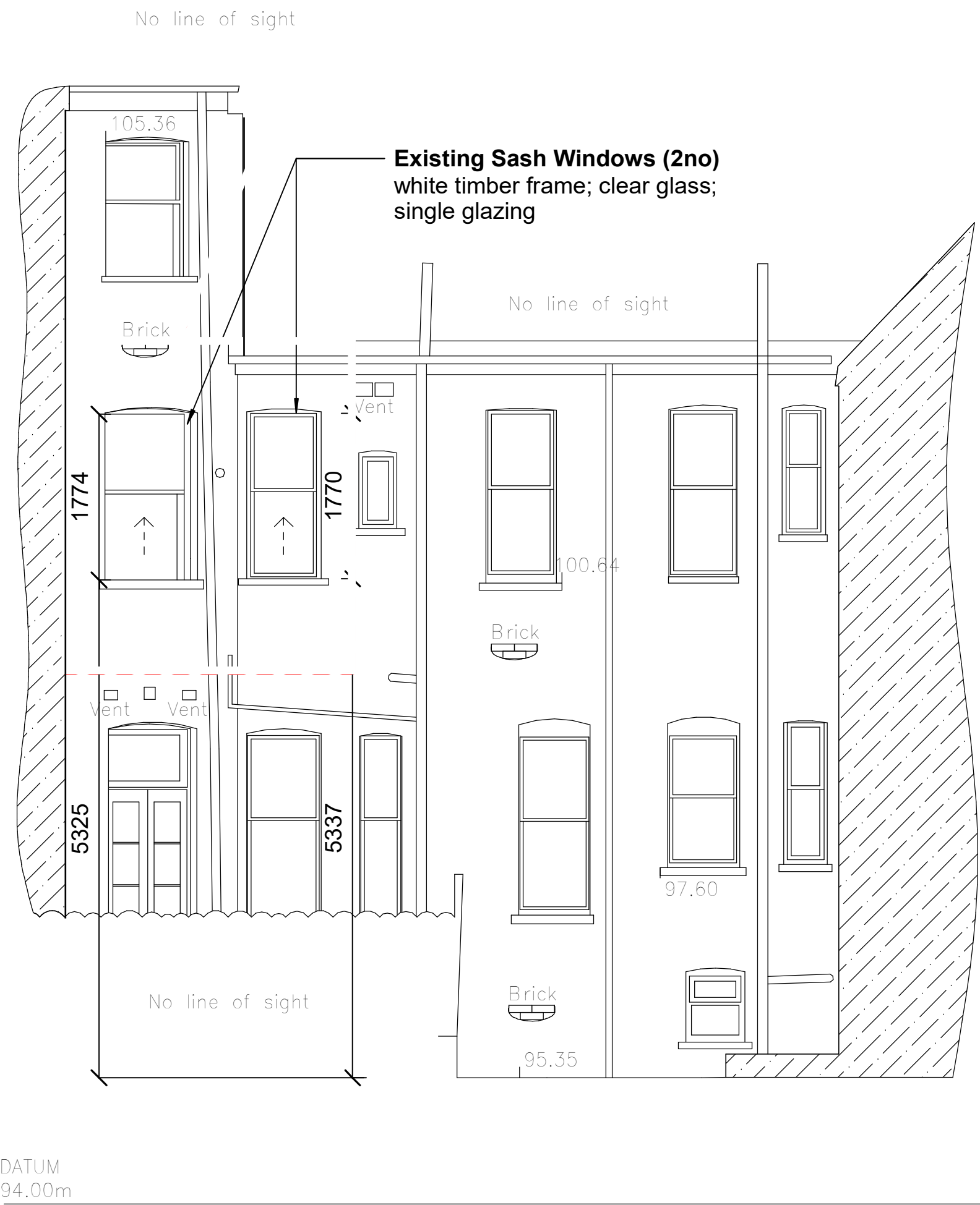
ELEVATION 3 - SOUTH