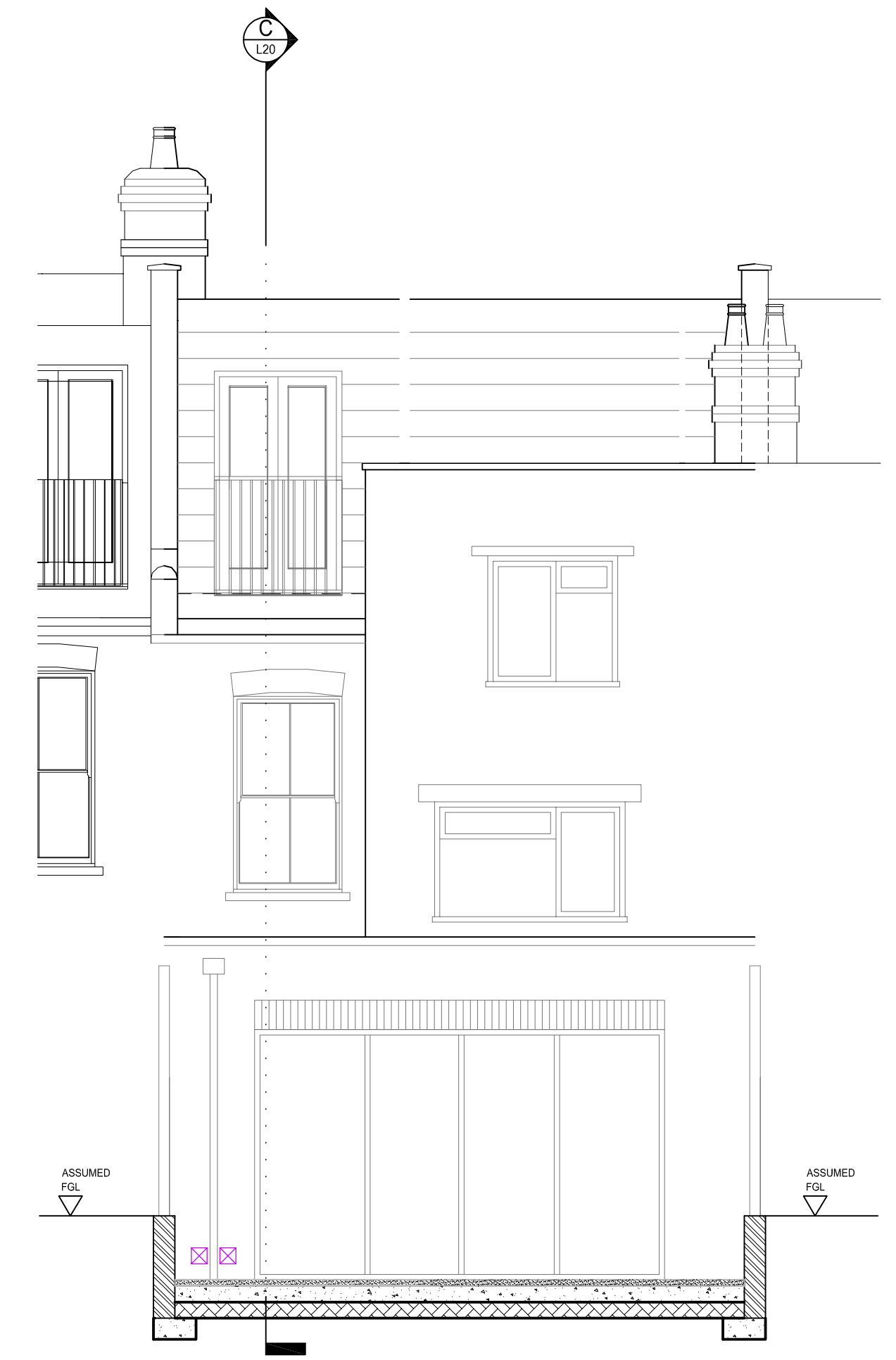
B L20 EXISTING REAR ELEVATION 1:50