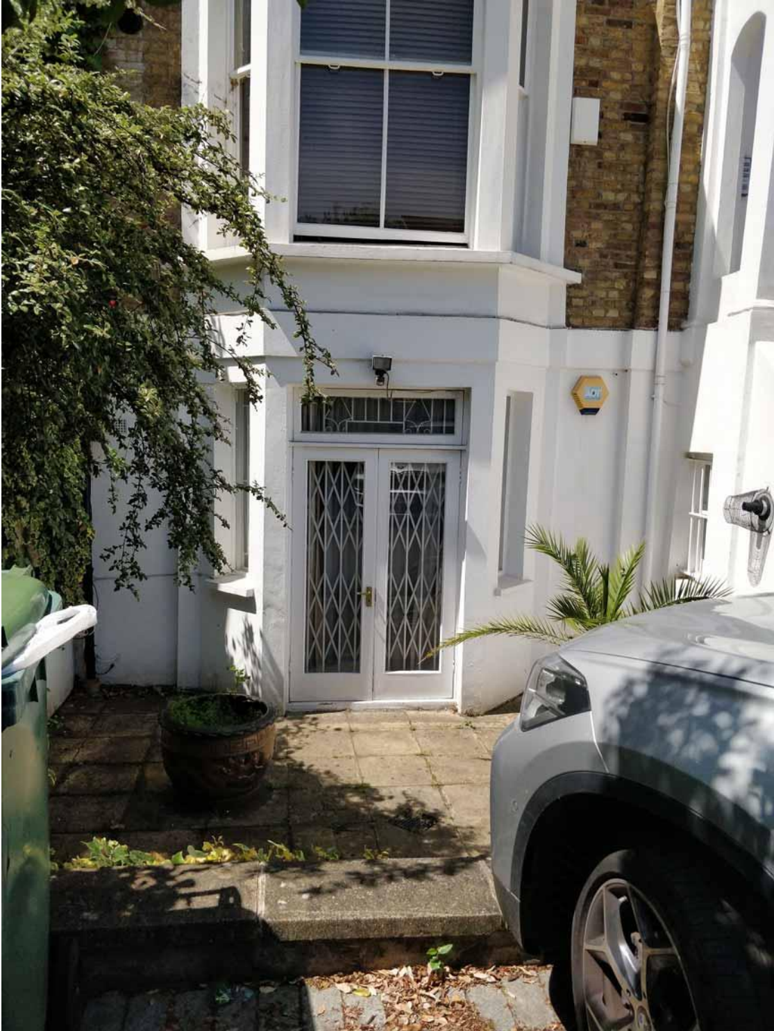
2. No. 17 Parkhill Road