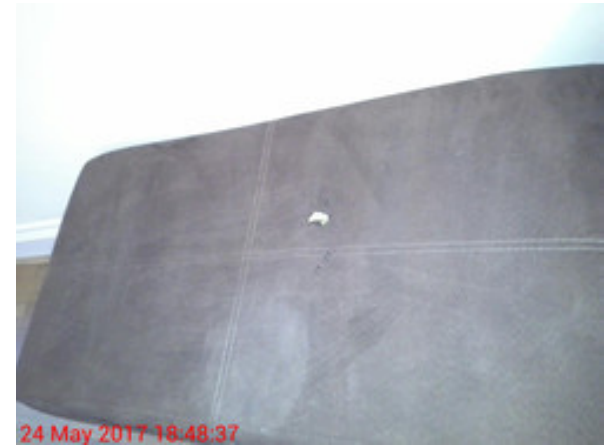
Reception Room, Free Standing Furniture, Burns to storage bench lid