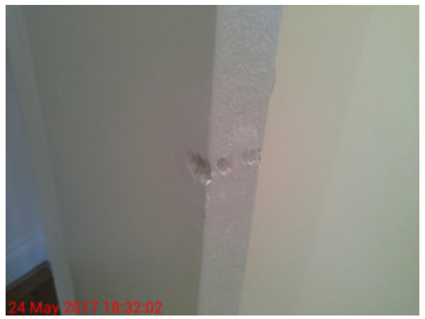
Bedroom 1, Fitted Units/Cupboards, Chips and indents to mid door edge