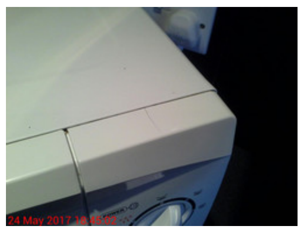
Kitchen, Appliances, Hairline crack to microwave surface