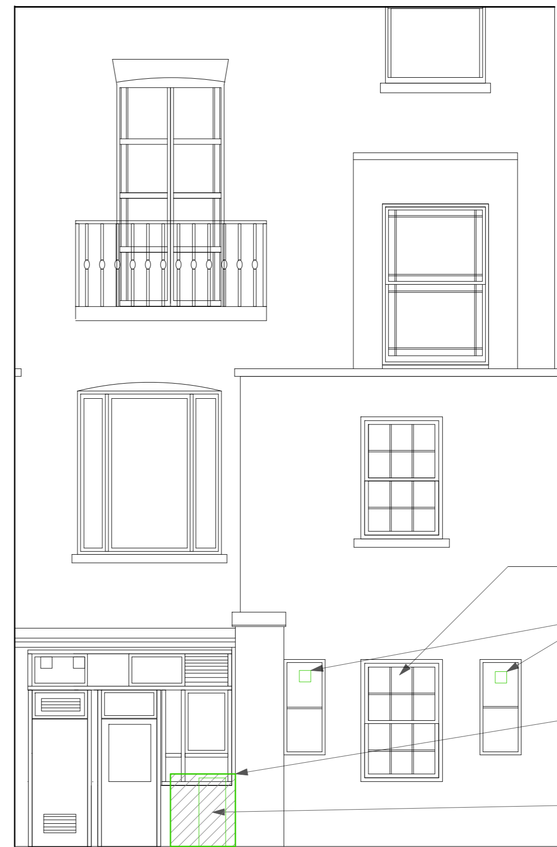
Proposed rear elevation section

Existing vents to be removed from windows