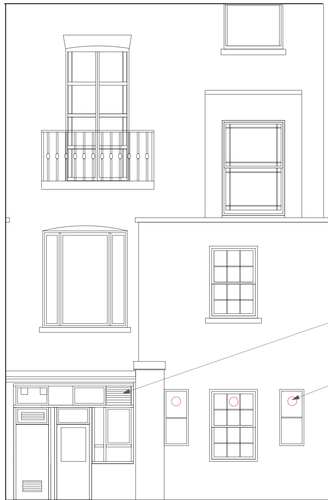
Existing rear elevation section

Existing ventilation grill with hood to be retained