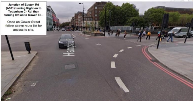
Junction of Euston Rd (A501) turning Right on to Tottenham Cr Rd, then turning left on to Gower St – Once on Gower Street follow above route list for access to site.