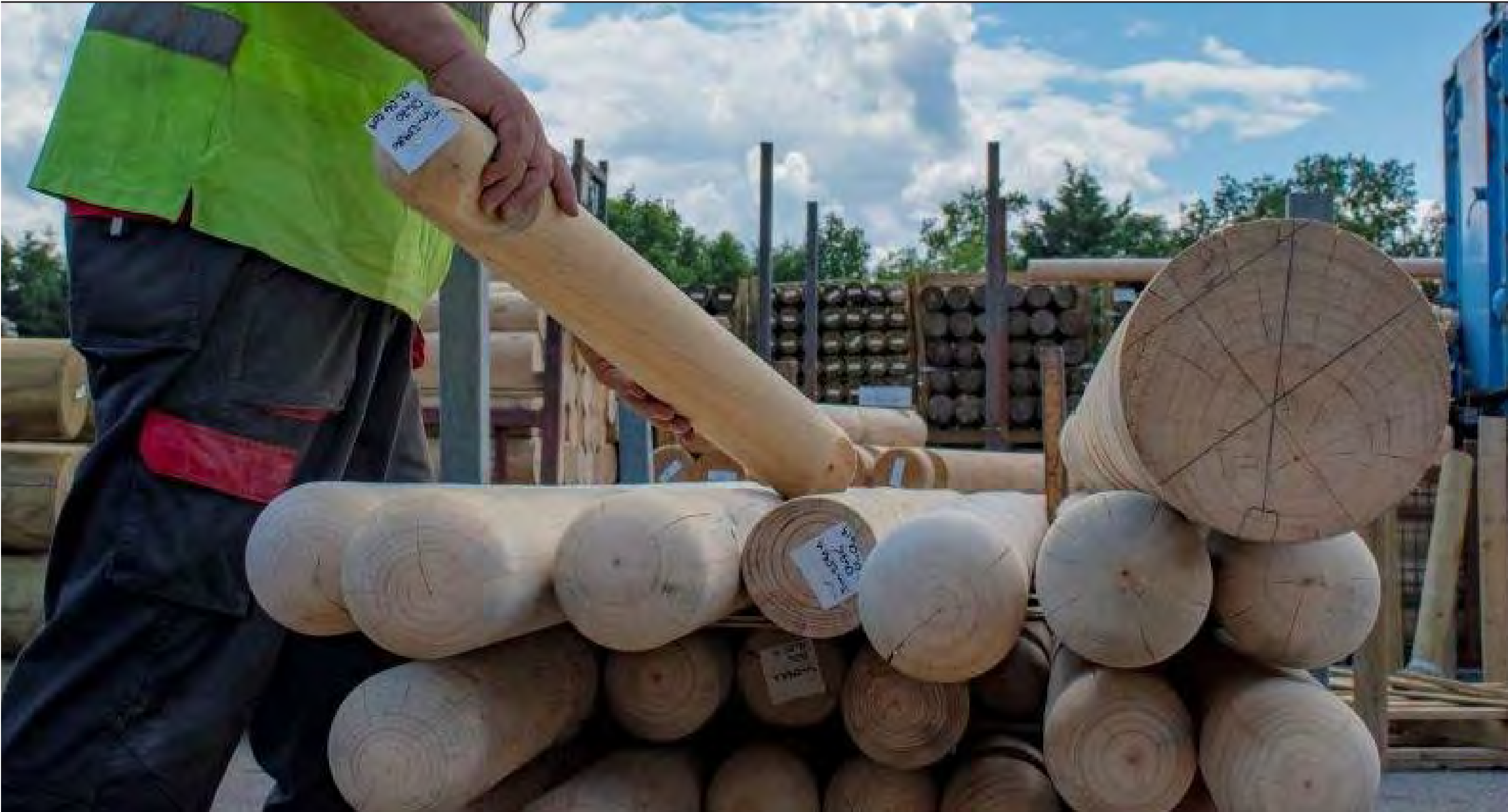
TIMBER PLAY WEAVING POLES

TIMBER PLAY READY GRADE POLES, 150MM DIAMETER, FREE OF SHAKES AND SPLITS SUITABLE FOR PLAY AREA. 1.5M HEIGHT ABOVE GROUND LEVEL AND STRUCTURALLY SECURED INTO THE GROUND