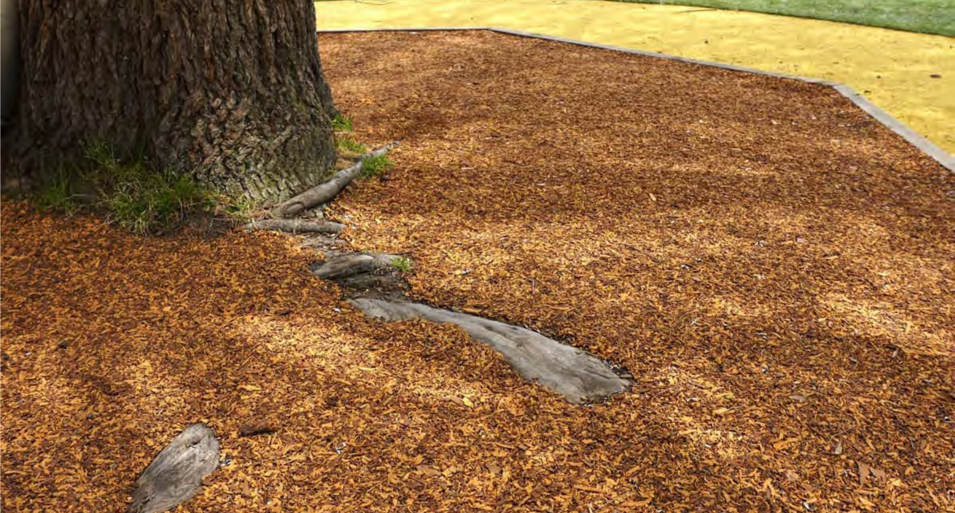
TIGER MULCH SURFACE TO WEAVING POLES AREA