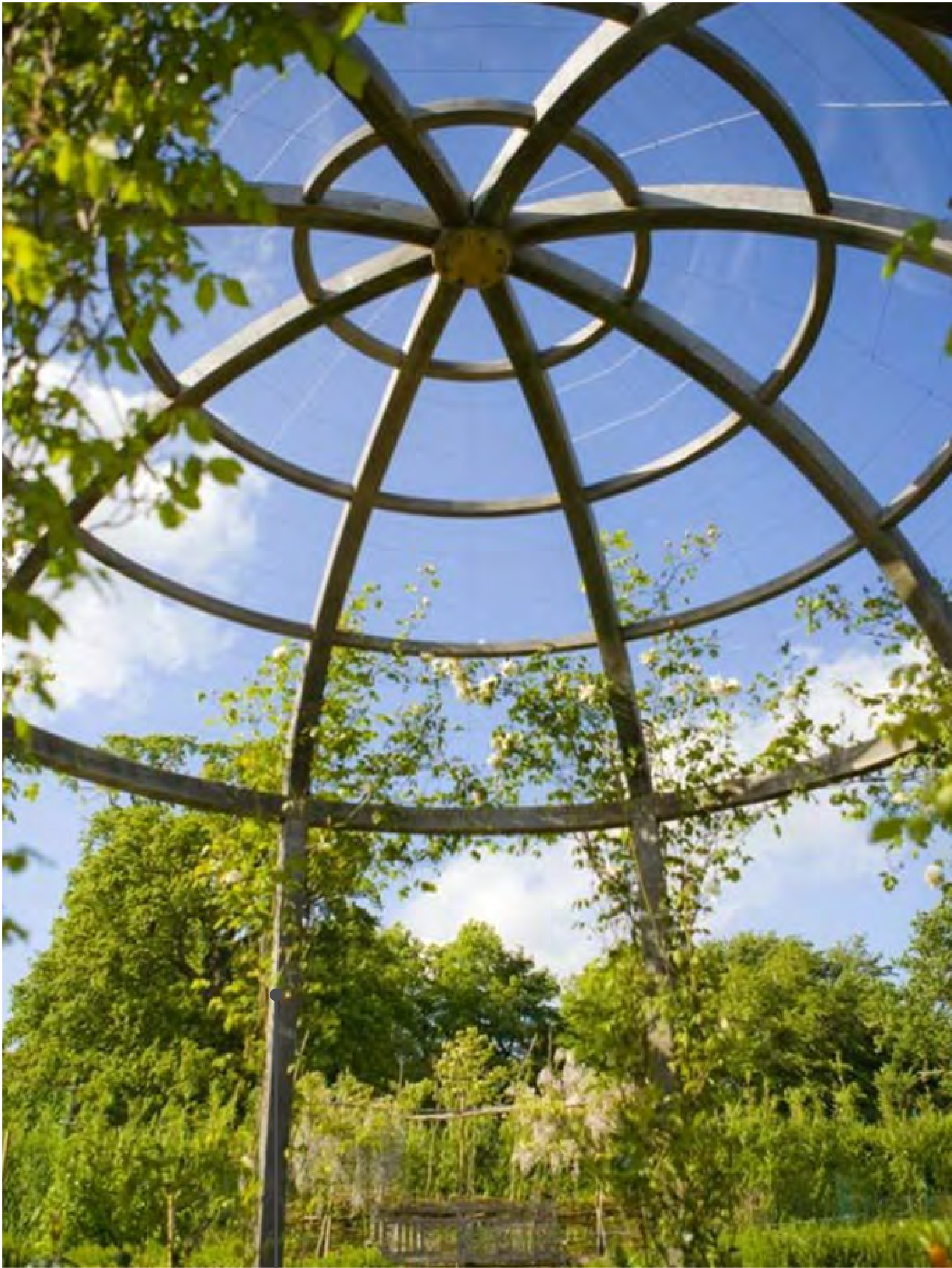
GAZEBO - REFERENCE IMAGE TIMBER FRAME STRUCTURE