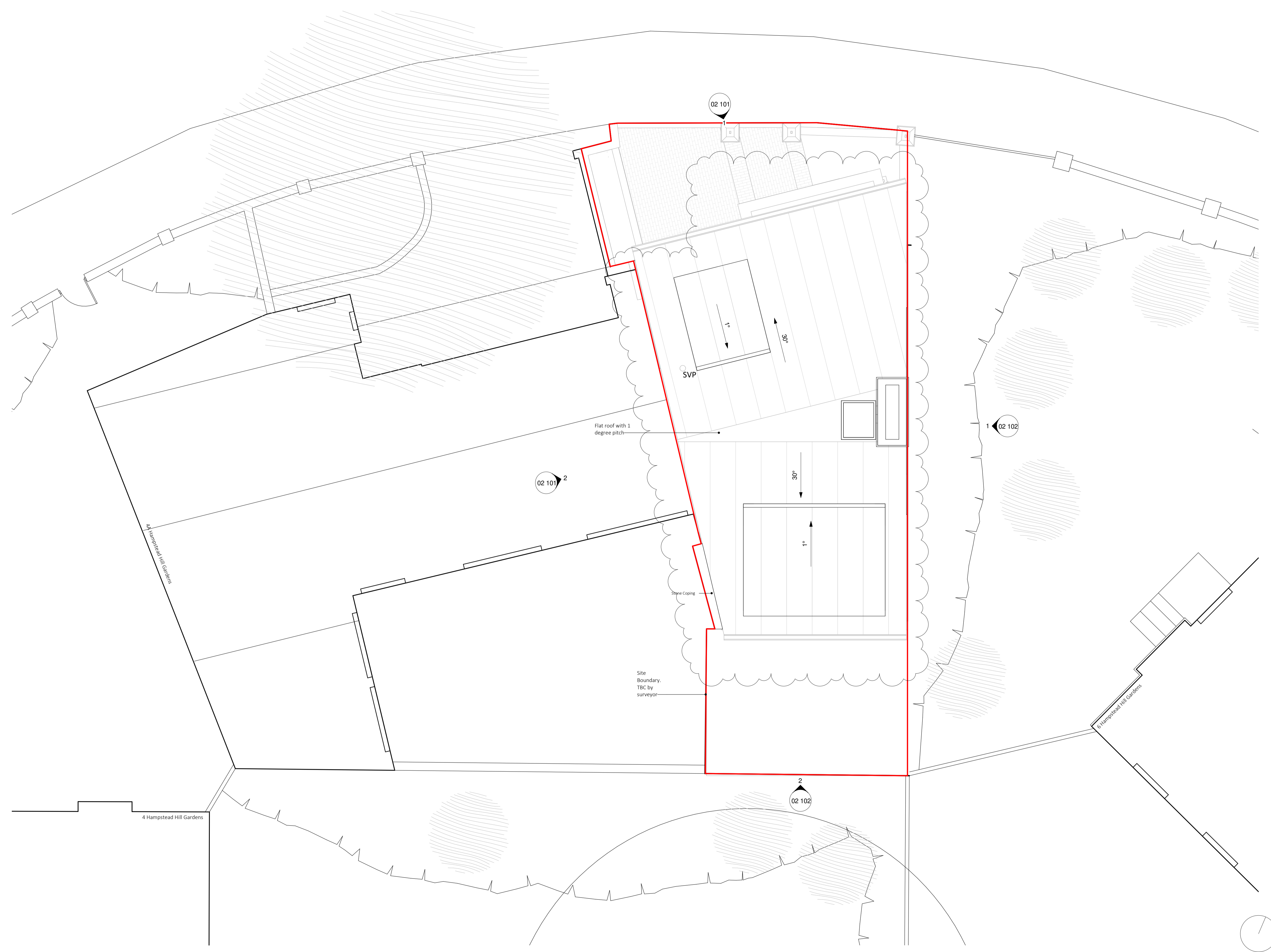
1 Roof Plan 1 : 50

General Notes The copyright of this drawing and design remains the intellectual property of the designers and may not be used without the written permission of Architecture for the Senses Limited. Do not Scale. Verify all dimensions on site before commencing work or preparing shop drawings. Report any discrepancies, errors or omissions to the designers and await further instructions before the commencement of works. All building materials, components and workmanship to comply with the appropriate public health acts, building regulations, British standards, codes of practice and the appropriate manufacturer's recommendations. Ensure all works are carried out within the prescribed hours of work and that all tools are of a non-percussive type where possible. Refer to the relevant drawings or method statement for all specialist work.