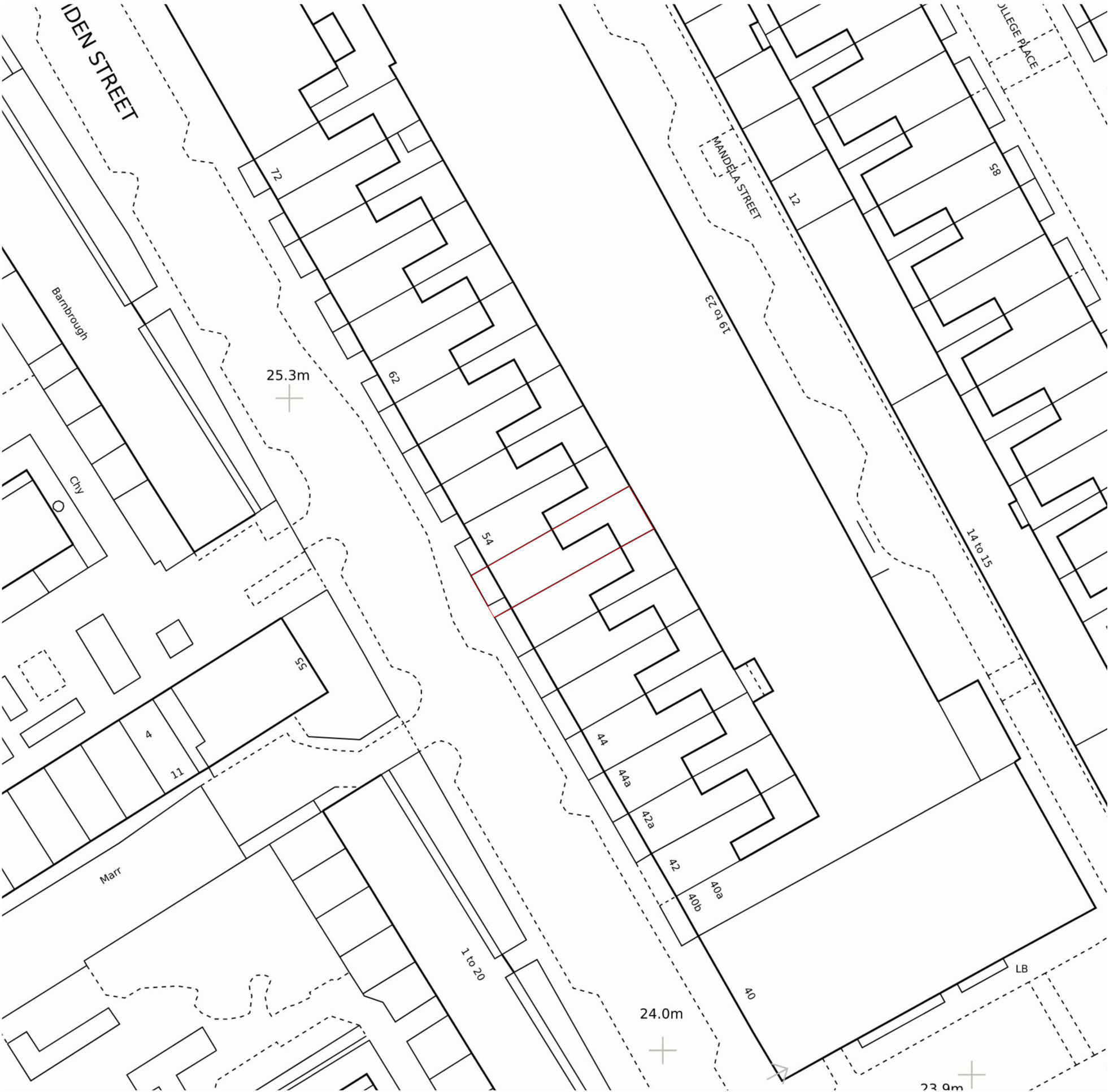
Existing Block Plan

Any dimensions shown should be checked on site and discrepancies reported to the Architect prior to construction. Designs are not coordinated with engineer projects. Do not scale for construction purposes.