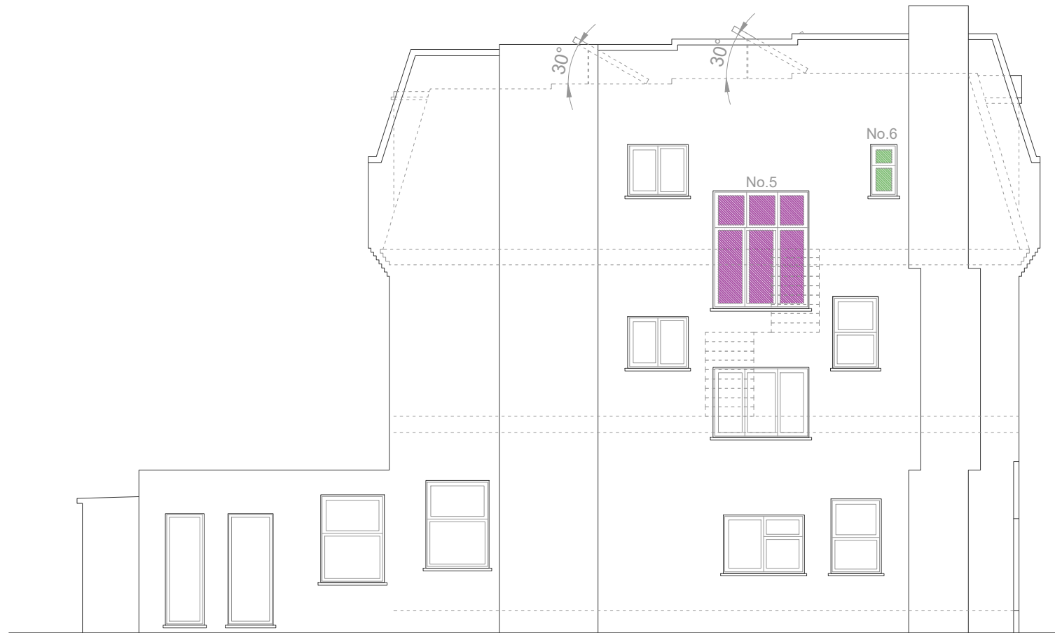
SOUTH WEST SIDE ELEVATION E: 1/100