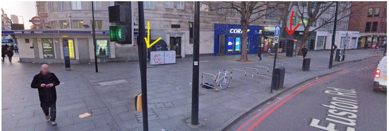
Image 2: The footway currently with existing Kiosks (marked with red arrow to be removed) street furniture and proposed kiosk (marked in yellow).