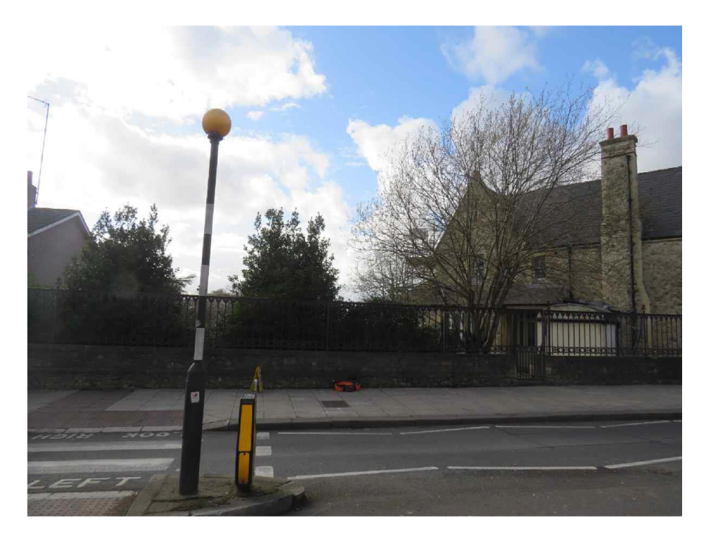
Figure 1 - Site Photograph's

Proposed location of a new mast shown above will assimilate well into the immediate street scene and not be detrimental.