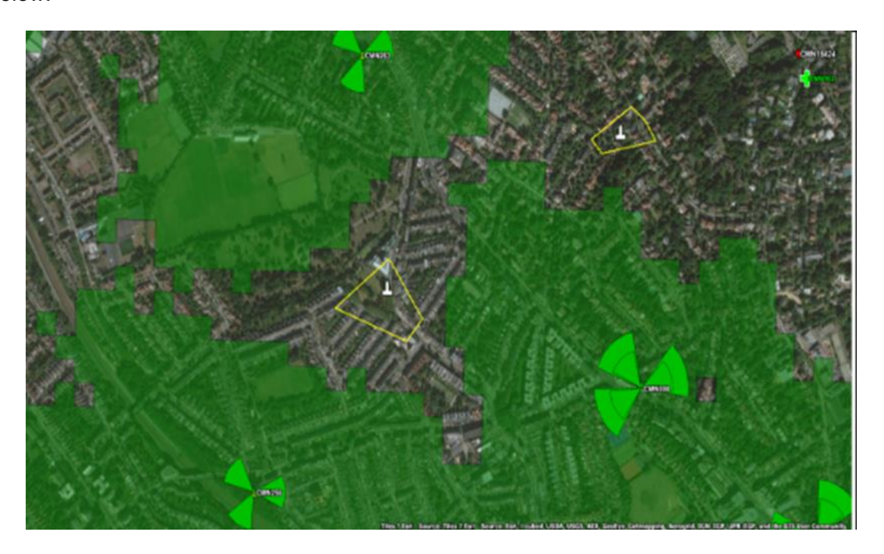
Figure 4 - Coverage Map: Proposed installation must be located close to the area shown below.

The optimum solution from the perspective of cell planning and radio coverage has been put forward. The target Search Area (shown as by the yellow outline) and existing CK Hutchison Networks (UK) Limited) UK sites are illustrated within Figure 4 below: