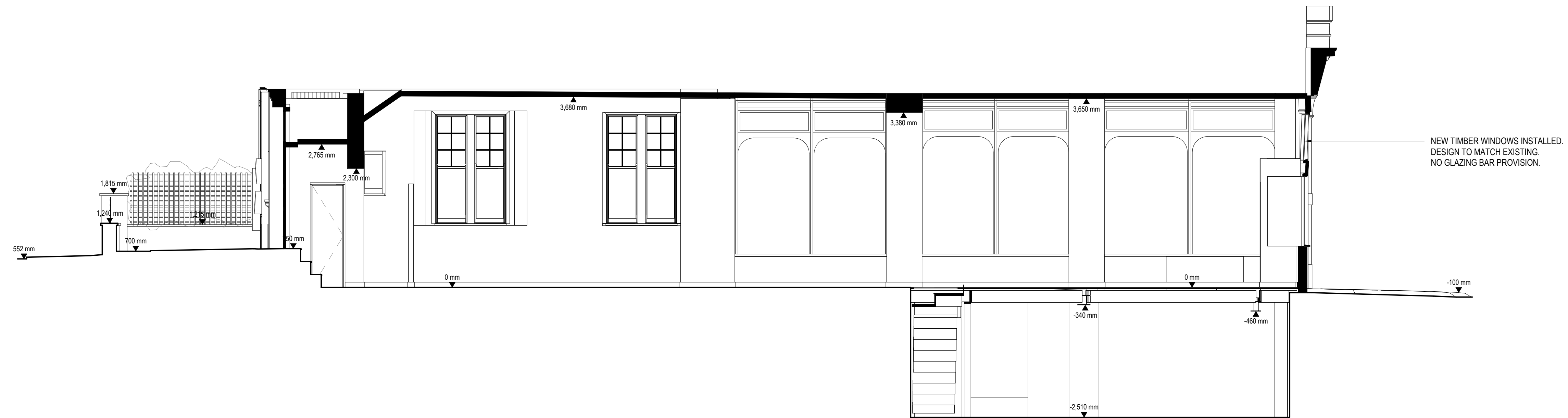
2 NEW ZZ SECTION 2 1:50 @ A1