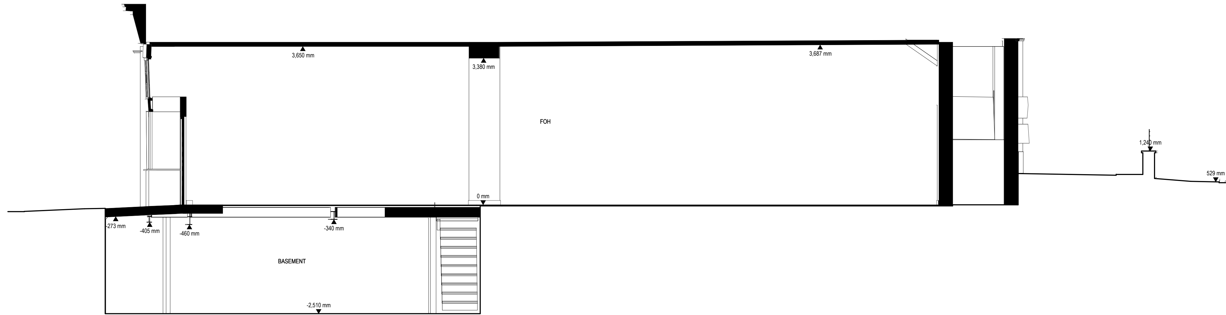
1 EXISTING ZZ SECTION 1 1:50 @ A1

Do not scale from drawings, use annotated dimensions only. Drawings represent spatial coordination intent. Contractor / fabricator is responsible for construction methods, structural integrity and performance of all elements. Design and positions of all fixtures and fittings are subject to specialist contractor shop drawings and confirmation on site. Drawings to be read in conjunction with all other relevant drawings and specifications by all design disciplines. The contractor is to verify all dimensions and levels on site prior to starting work or fabrication. This scheme may be subject to Town Planning and other necessary consents. Ensure Building Control are notified 48 hours in advance of building works starting on site. There is a risk of injury or death in construction if the works are not properly planned and supervised. The contractor must not undertake any element of the work without preparing the necessary PAFs. All works to be carried out in accordance with current health and safety regulations. All works to comply with current British and European standards and regulations. This drawing is © TIM GREATREX ARCHITECT LIMITED 2023 Not to be reproduced without written consent.