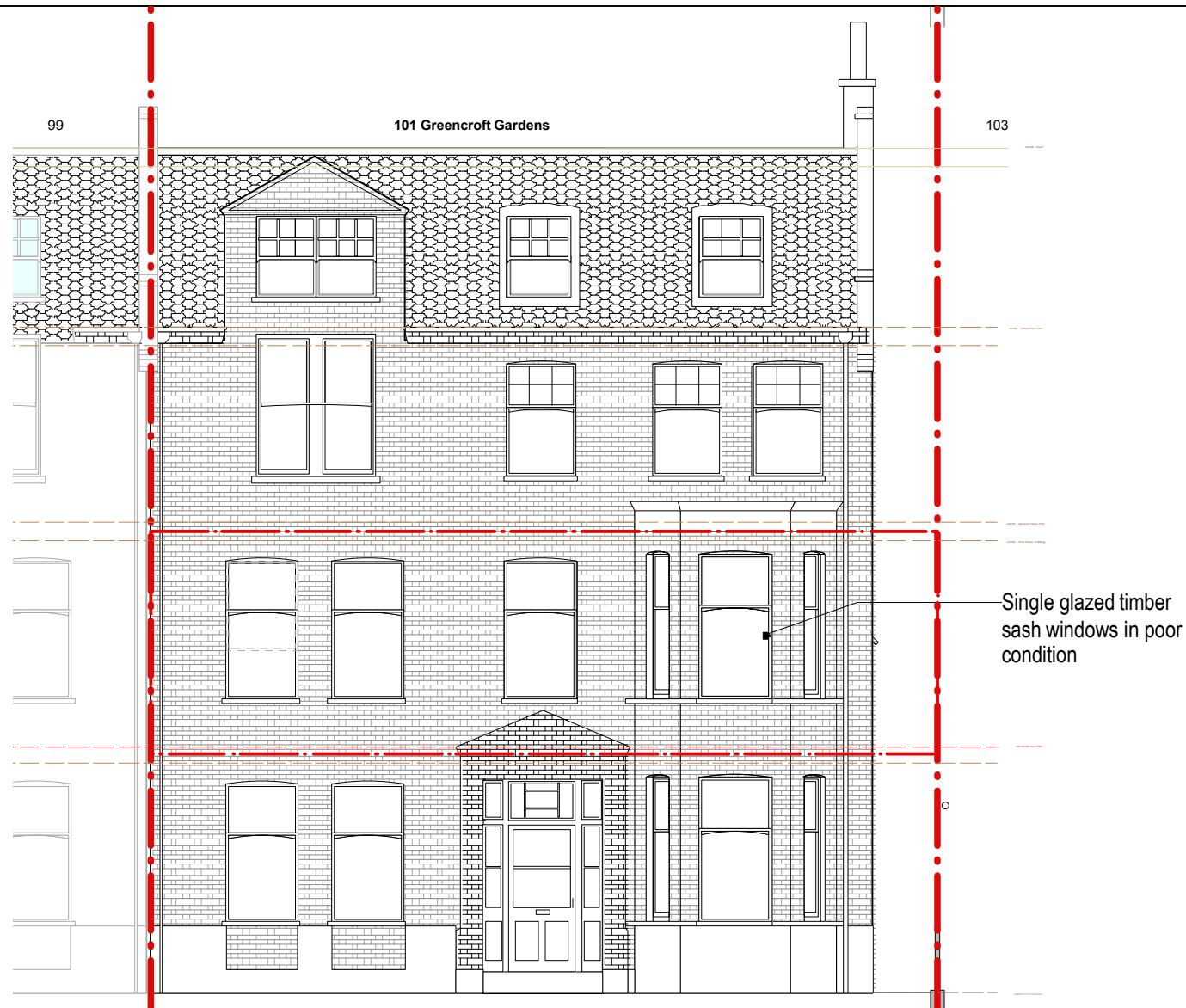
1 Existing Front Elevation Scale: 1:100