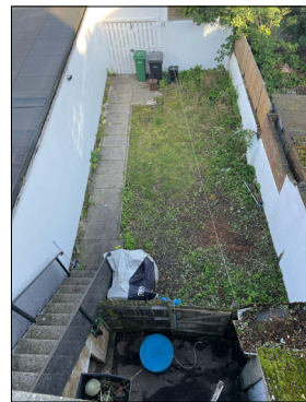
Photographs towards rear boundary wall