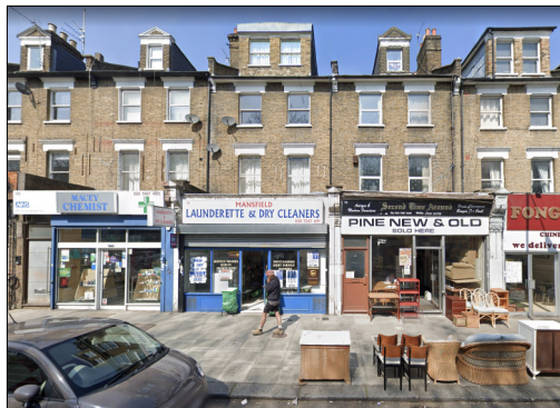
Aerial photographs + Front Elevation