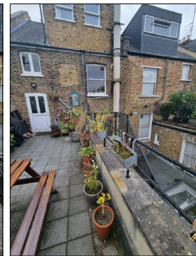
Photographs towards rear of main host building