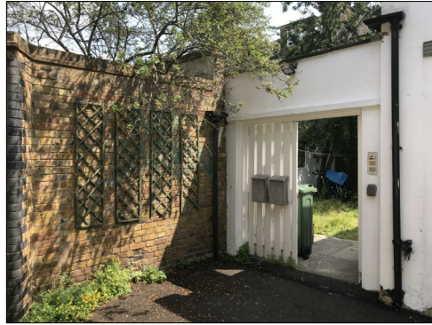
Photographs of rear private access via Courthope Road