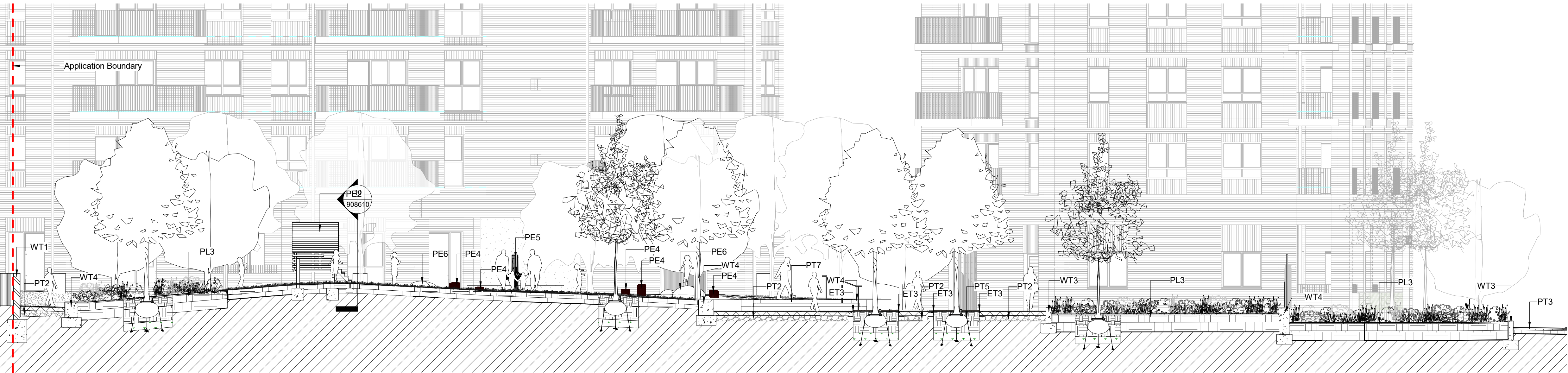
2 Illustrative Section 02 1 : 100