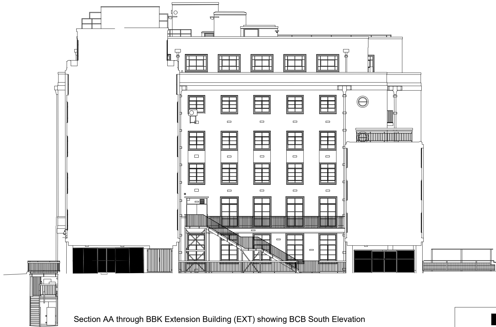
Section AA through BBK Extension Building (EXT) showing BCB South Elevation