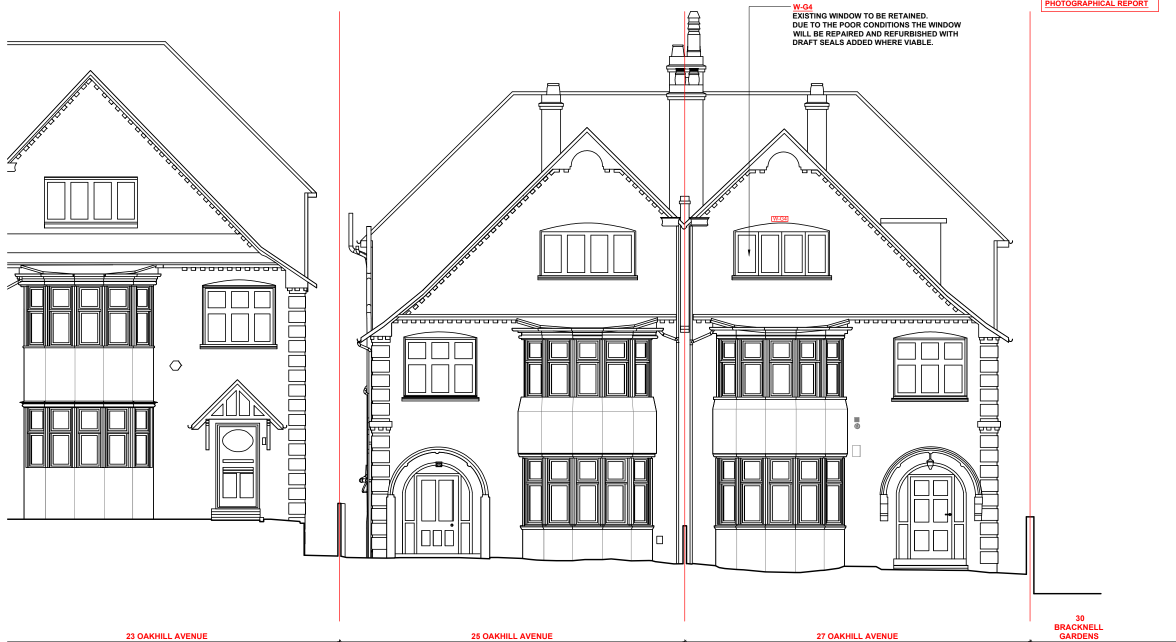
1 FRONT ELEVATION - PROPOSED_ SCALE 1:100 @ A3