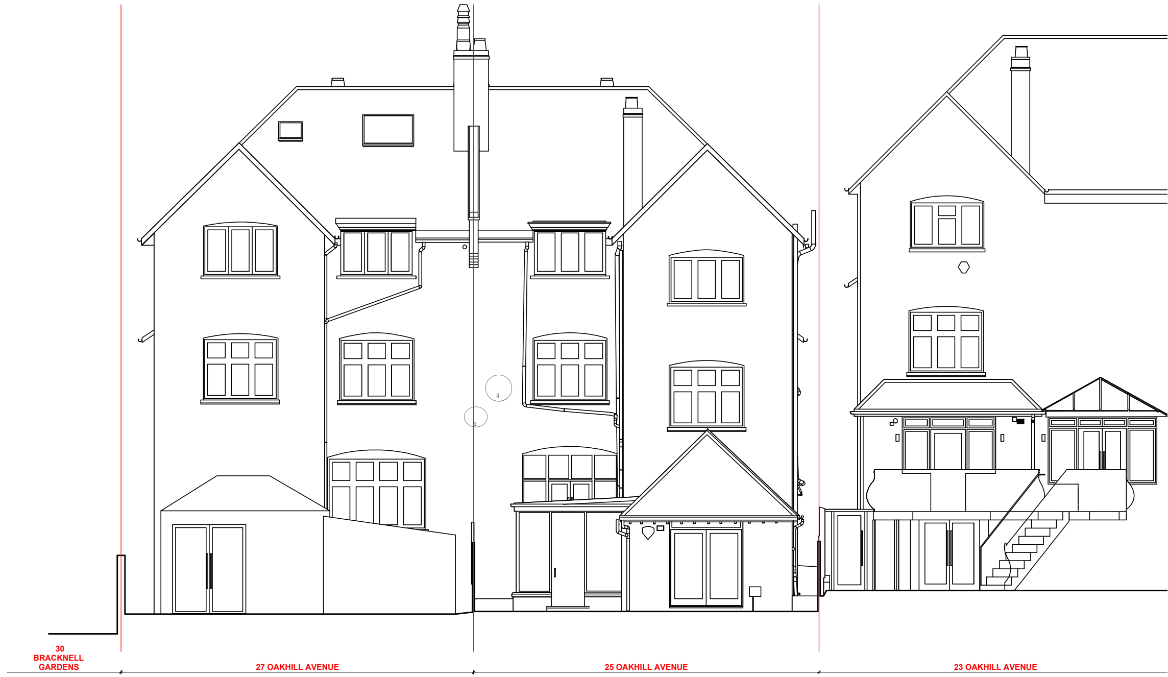
1 BACK ELEVATION - EXISTING_ SCALE 1:100 @ A3