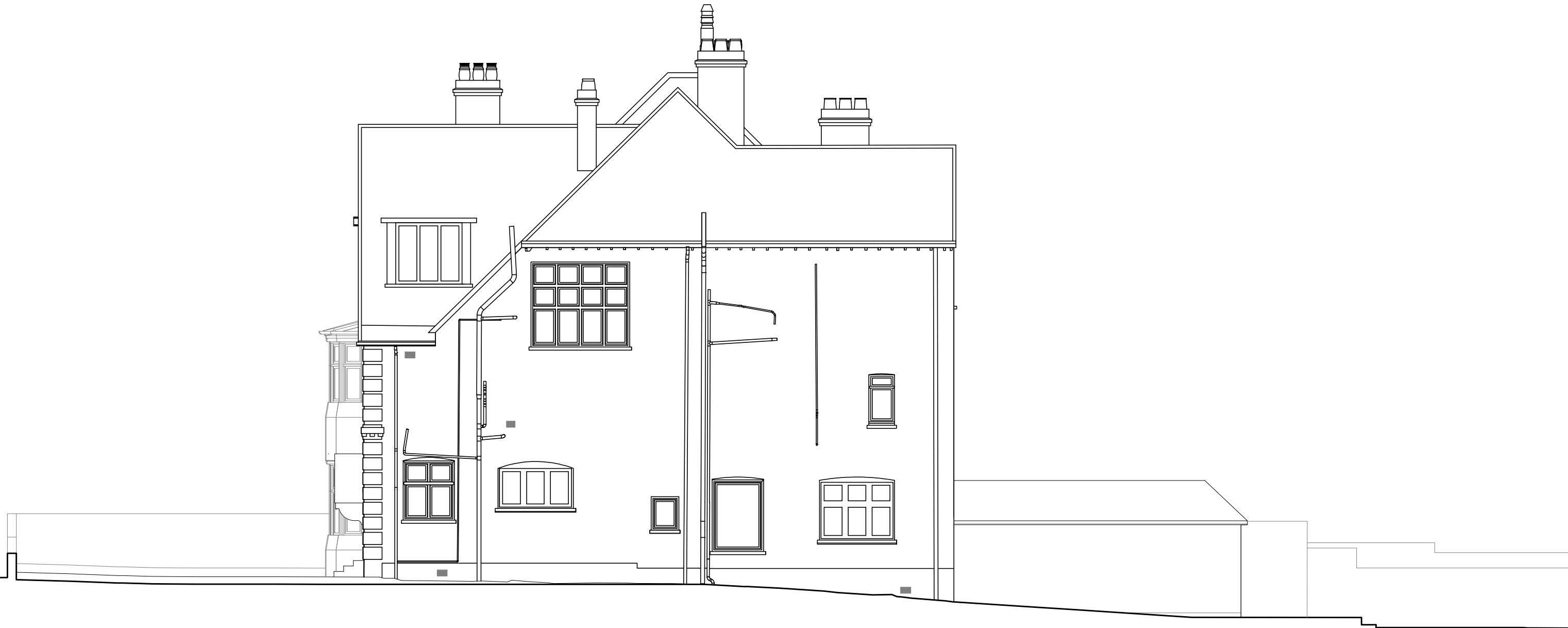
1 SIDE ELEVATION - EXISTING_ SCALE 1:100 @ A3